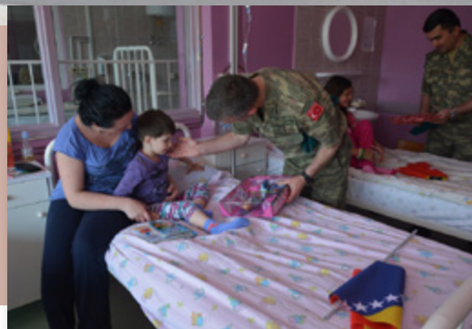
Members of the Turkish military mission mingled with the patients of the Pediatric department and handed them gifts