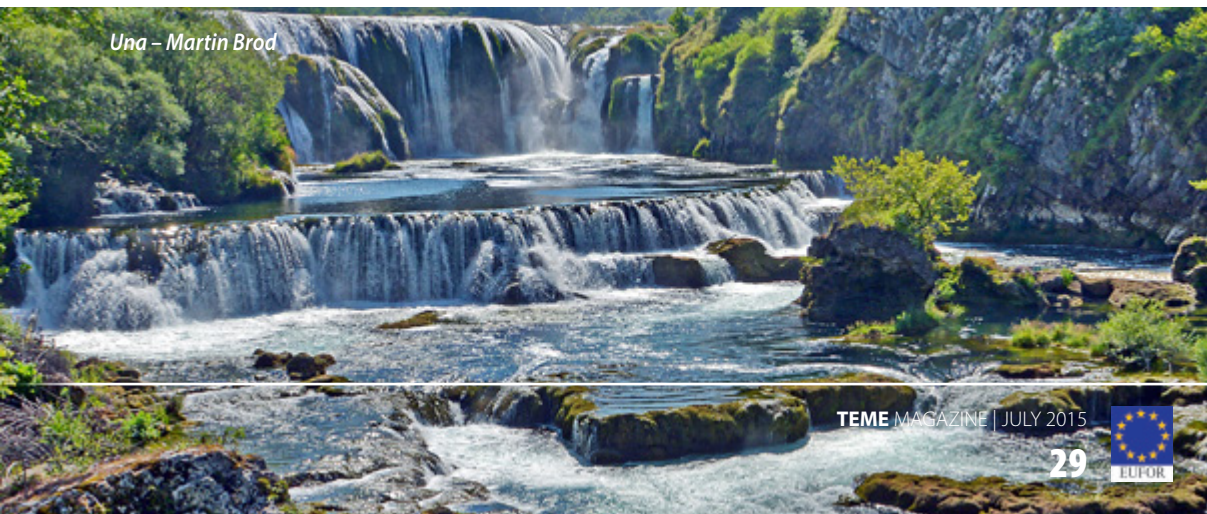
Una – Martin Brod

Sixteen nature landscape reserves, eight strict nature reserves, three national parks, eight special nature reserves and one hundred and ten natural