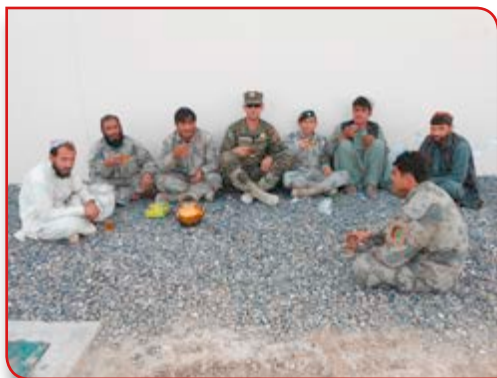
A moral responsibility towards the world