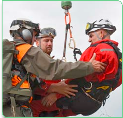
The valuable role of the Mountain Rescue Teams during the natural disasters

"The purpose of this information campaign is to show to the general public in BiH our efforts in the field of education and training of the AF BiH. The purpose of the capacity building and training campaign, that was launched today, is to promote the good work that is being done between EUFOR and the Armed Forces of BiH, to show they are being trained to international standards and