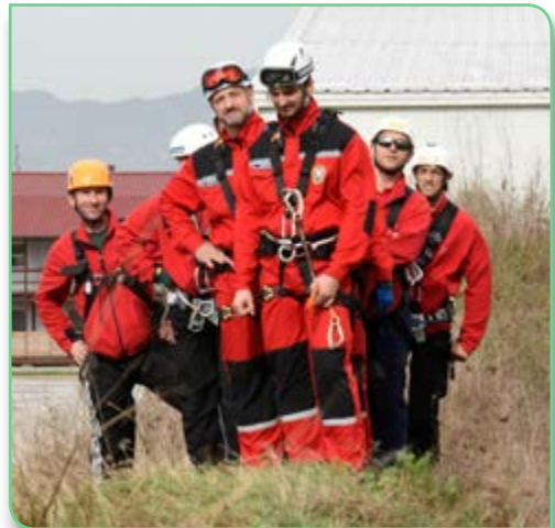
Mountains rescue teams from Zenica and Mostar