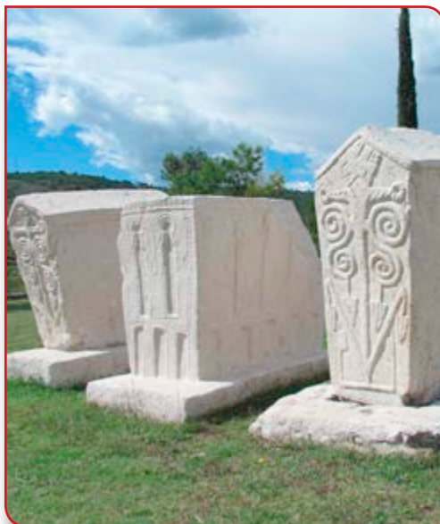
A cultural phenomenon of BiH

Photo Radimlja: In Stolac, on the road between Mostar and Trebinje, in a place known as Radimlja, there is a huge necropolis, which is attributed to the cult of Bogomils. These tombstones are carved