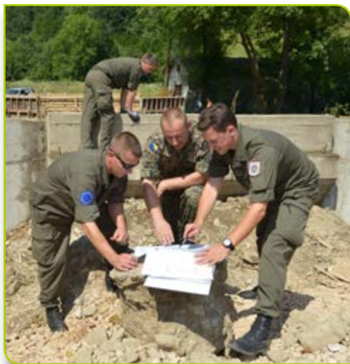
Engineers of AFBiH and EUFOR discuss the plans for the bridge in Dokanj

With close coordination and cooperation with AFBiH, NATO and Troop Contribution Nations we are trying to compile all efforts related to training to enhance AFBiH capacities and capabilities.