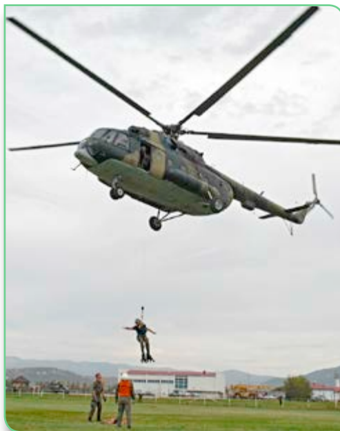
The access to the minefield by air