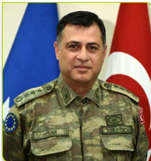
Colonel Hakan Aplak, the Deputy Chief of Staff of EUFOR

Colonel Aplak: It is common knowledge that a modern army these days faces various challenges, nationally and internationally. International crises in our globalized world need an international response. A single state wouldn't be able to counteract a crisis with an international dimension. Armed Forces must therefore be able to work with each other. And as any other organization, this must be learned. It begins with simple things such as being able to speak with each other (language skills) and ends with the complex procedures that a big organization needs to go through to fulfill its tasks. In simple words, the more similar the methods of doing things are, the