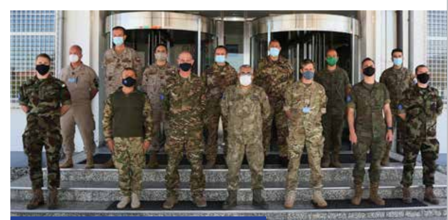
Key Leader Training programme attendees

Following a strictly timed schedule over the four days, the key leaders received presentations, briefings and content from a wide range of branches.