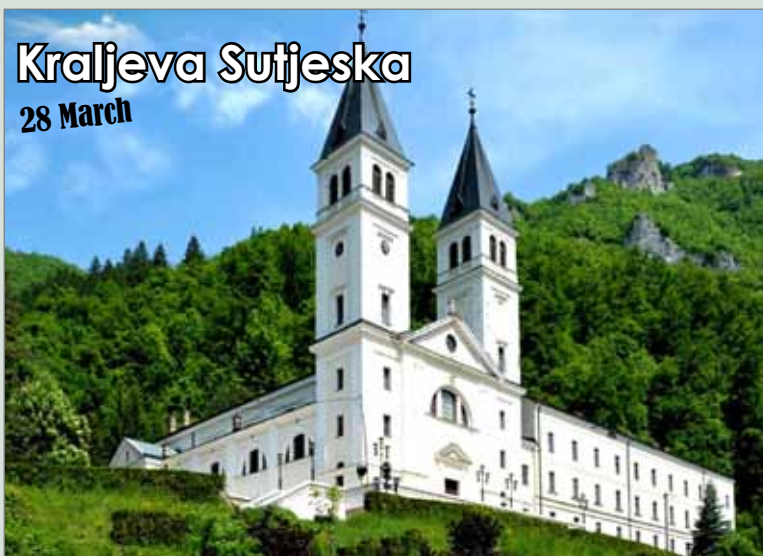
Kraljeva Sutjeska 28 March

The best photo will be published in the next EUFOR Forum and win EUFOR branded POWERBANK.