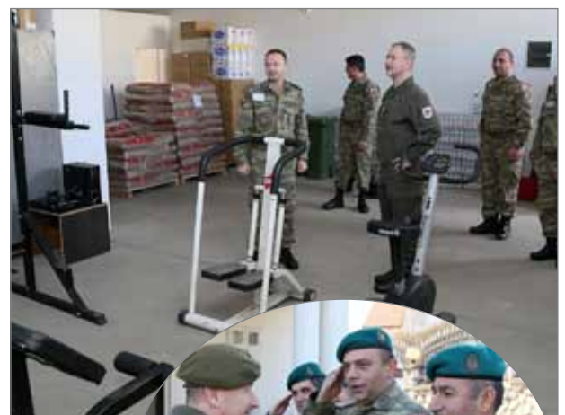
LOT House Zavidovići