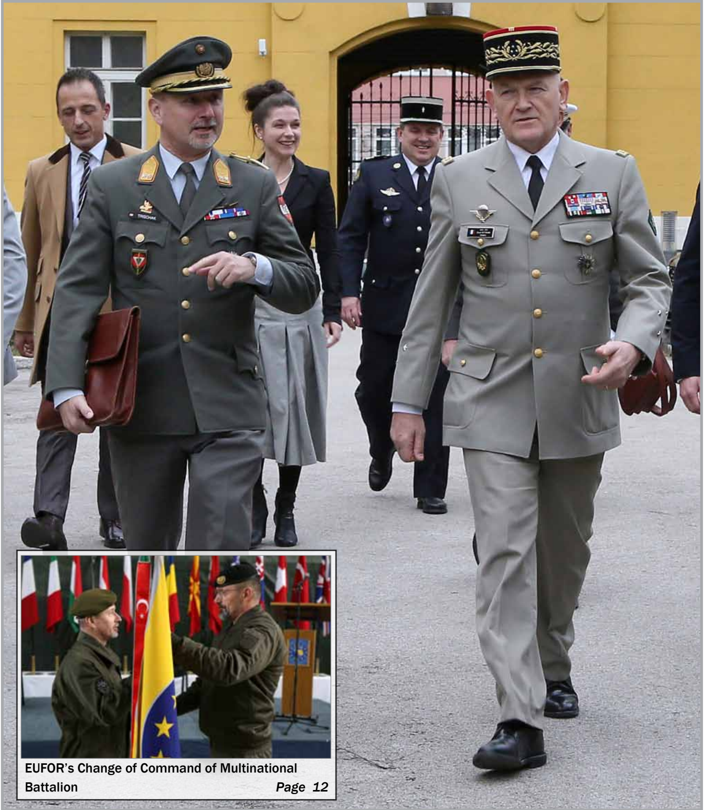
EUFOR's Change of Command of Multinational Battalion Page 12