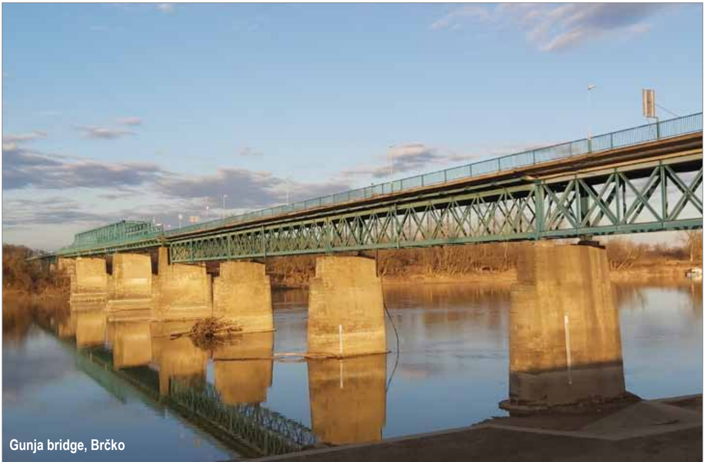
Gunja bridge, Brčko