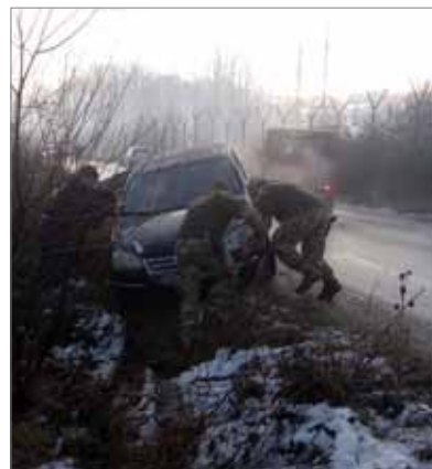
Stopping to provide assistance, the patrol found two male passengers requiring help to get their car back on the road.