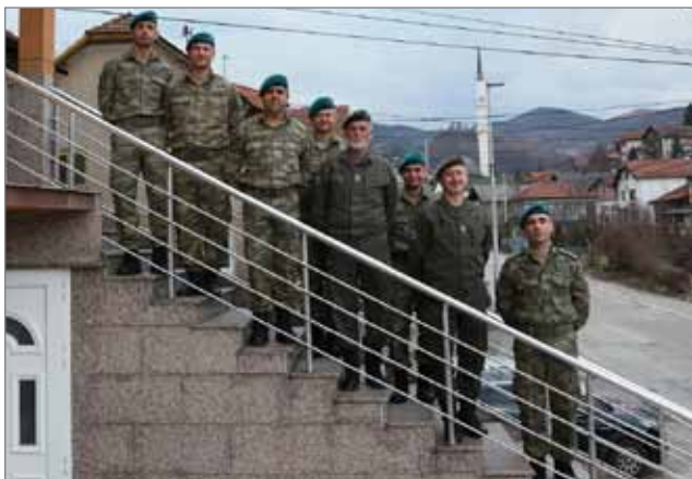
LOT House Zenica

other tasks, such as delivering essential Mine Risk Education to more than 15,000 individuals per year; including vulnerable and at-risk groups such as farmers, forestry companies, hunting clubs and school children of all ages.