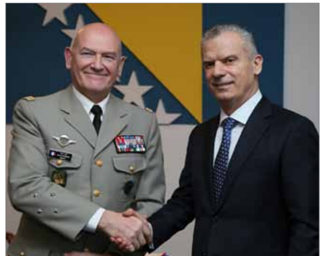
EUFOR Operation Commander with Minister of Security of BiH, Fahrudin Radončić.