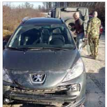
The pair of travelers involved were not so lucky, as there appeared to be significant damage to the Peugeot car.