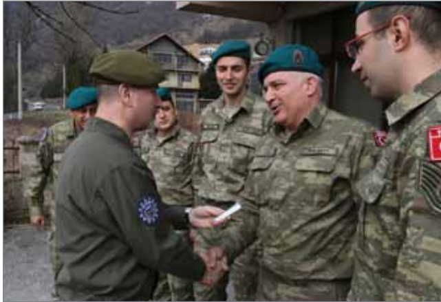
LOT House Travnik