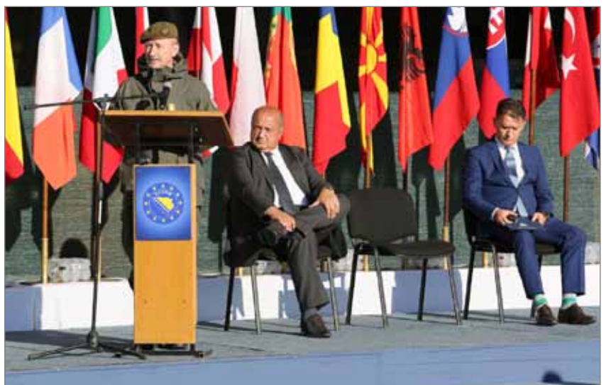
From L-R: COMEUFOR, Major General Reinhard Trischak, the Deputy Minister of Defence Mr Sead Jusić and the Deputy Minister of Security Mr Mijo Krešić

The EUFOR reserve troops which have arrived from Austria, Bulgaria, Greece, Romania, the United Kingdom and KFOR joined their comrades from EUFOR's Multinational Battalion on parade before heading off to locations all over BiH for the exercise, which occurred between 7-11 October.