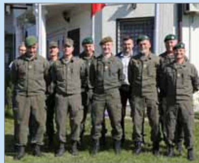
LOT House Tuzla