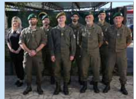
LOT House Bratunac