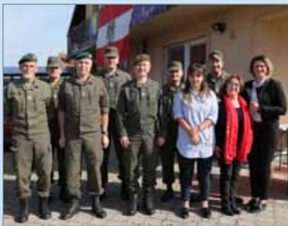
LOT House Brčko