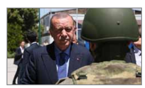
President of Turkey visits Camp Butmir