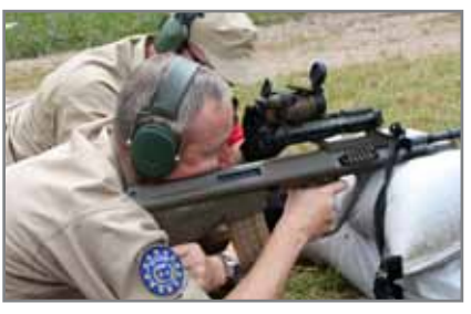
Three Nation Games held at Butmir