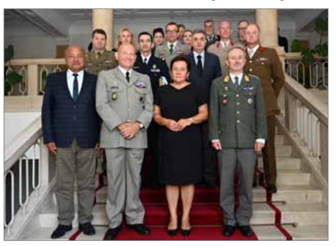
Meeting with the BiH Minister of Defence

significant progress within the Armed Forces of BiH, emphasizing that they are an example in the execution of their tasks, being one of the most trusted institutions in BiH according to public opinion surveys. Major General Trischak said, "In particular