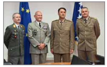
Operation Commander visits BiH