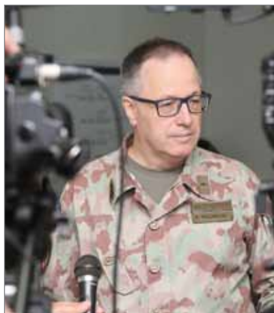
Colonel Trachsler (EUFOR SAWAD) speaking to the media

The BiH authorities currently hold over 62,000 SALW consisting of over 300 different types of weapons, the aim is to rationalise the holdings and reduce the number down to 22,500