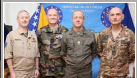
Lieutenant Generals Rittimann and Portolano visit Camp Butmir Page 14