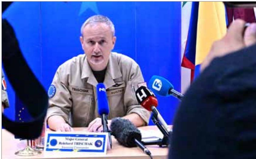
Major General Trischak addressing the press

My vision for my time here is to continue with the core mission of EUFOR: to help all of the people of Bosnia and Herzegovina to live together in a stable, viable, peaceful and multi-ethnic nation; to contribute to the safe and secure environment by supporting the institutions of Bosnia and Herzegovina; and to be committed to assisting the Armed Forces of Bosnia and Herzegovina with a successful path to European integration.