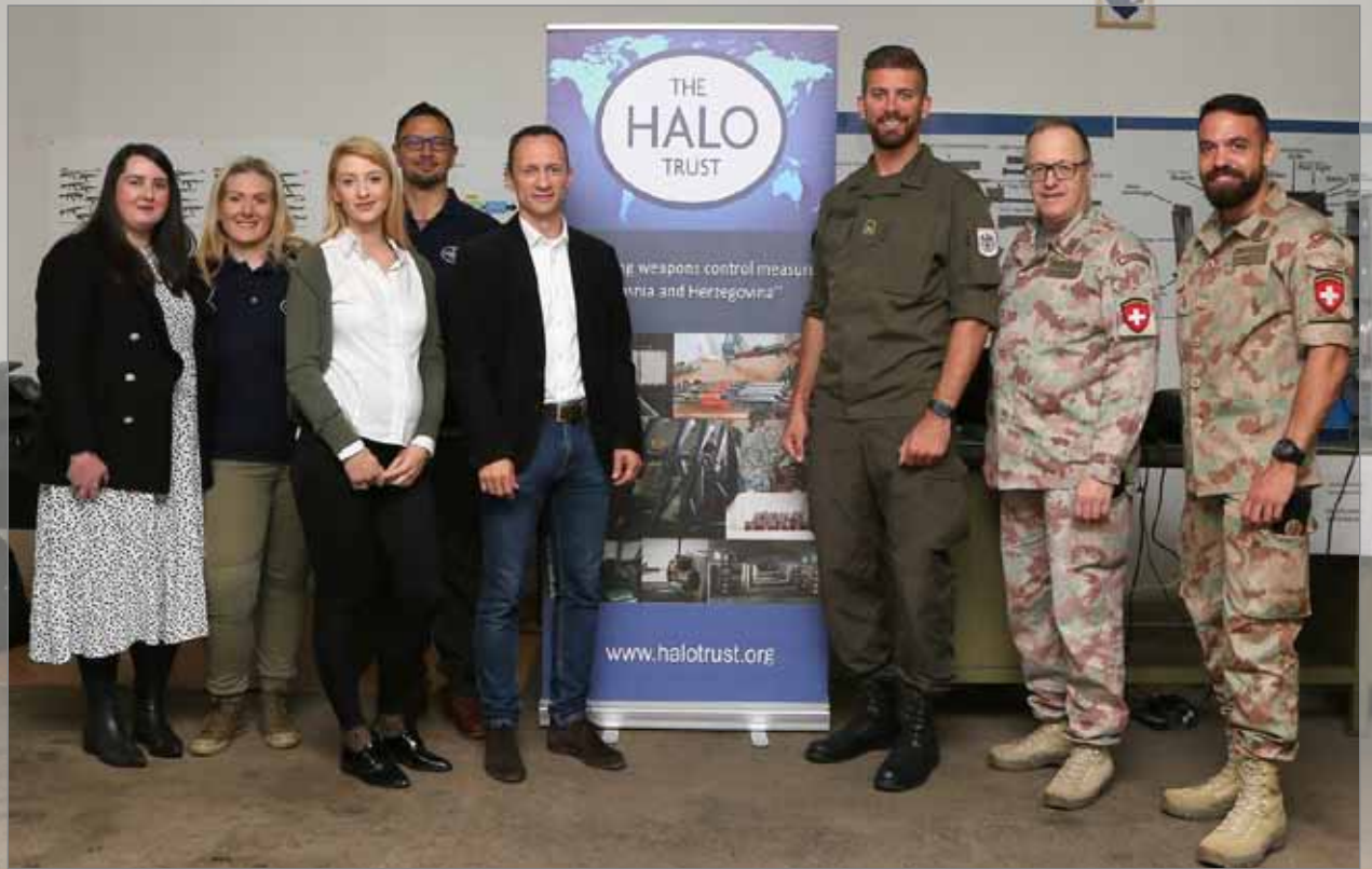
EUFOR and HALO Trust representatives

On Wednesday 29 May, in Rajlovac, a briefing was given by EUFOR Special Ammunition and Weapons Advisors (SAWAD) to a NATO delegation in order to summarise the progress made by the BiH Ministry of Defence (MoD), and the AFBiH, in weapons marking, registration and management.