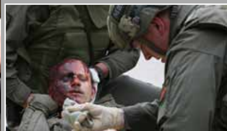
EUFOR mine training exercise completed on Mount Igman Page 11