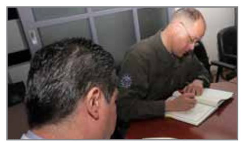
Memoranda of Understanding signed Page 7