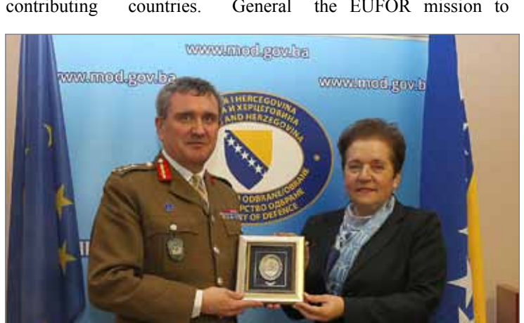
General Everard greeting Minister Pendeš

the During Minister meeting Pendeš said: "Thanks the Capacity Building and Training program that has been delivered by EUFOR, there has been significant increase in the operational capability, international and interoperability ofthe Armed Forces Bosnia of and Herzegovina".