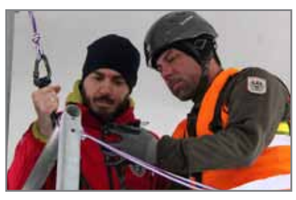
Emergency rescue training