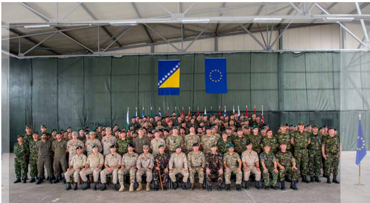
162 EUFOR personnel from 8 nations received the European Union Common Security and Defence Policy Medal "ALTHEA" for their dedicated service in Bosnia and Herzegovina.