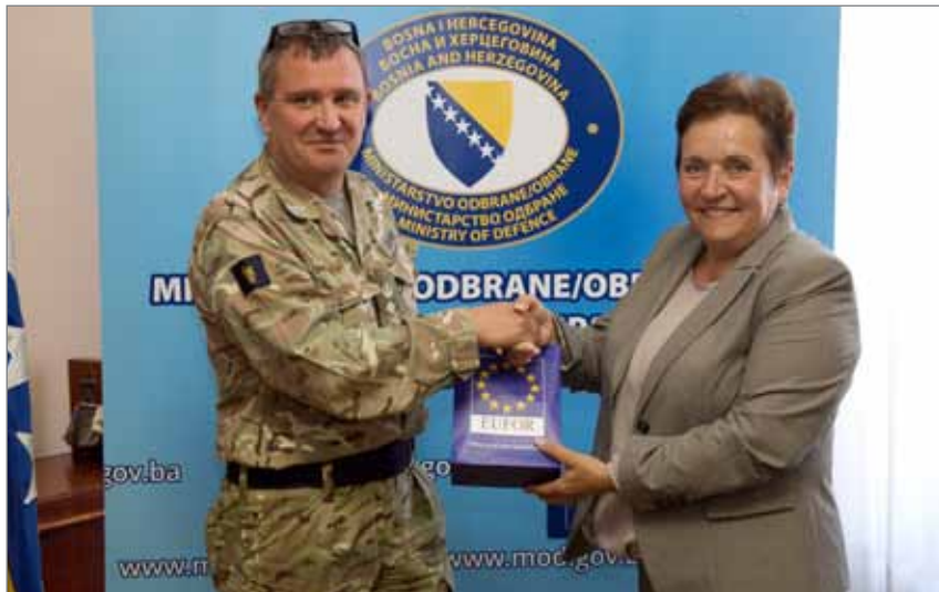
BiH Minister of Defence, Ms. Marina Pendeš greeting the Operational Commander.