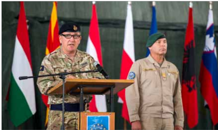
The Operational Commander of EUFOR Operation ALTHEA addressing the international medal parade at EUFOR HQ in Camp Butmir.

EUFOR Operation ALTHEA, currently made up of soldiers from 14 EU member states and 5 partner nations, works closely with NATO and the MoD BiH, conducting capacity building and training for the Armed Forces of BiH to contribute to the resilience of BiH and enable the Armed Forces BiH to successfully participate in international Peace Support Operations. EUFOR is fully committed to support BiH "on its path to a European future" and remains a vital enabling actor in the development and maintenance of a safe and secure environment, where the peace process can continue to move forward.