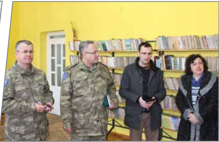
Visit the public library renovated by Turkish LOT