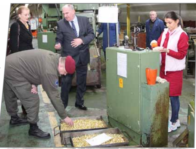
Igman General Director briefs COMEUFOR on the manufacturing process

two particular elements on this visit; future development of the Company and the method and results of the inspection itself. Both are key to ensure the company progresses and keeps up in the current market, which will also directly benefit the BiH economy."