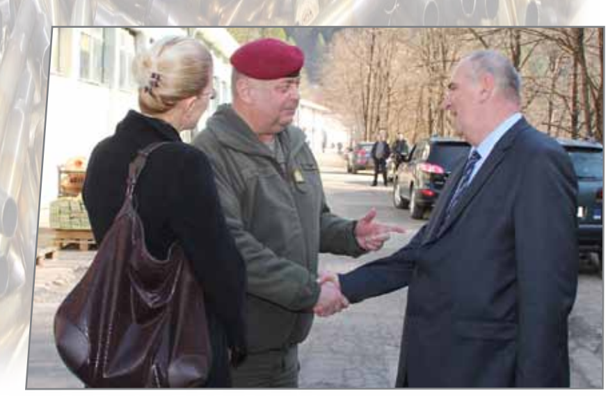
COMEUFOR meets with the Igman General Director

Future development of the Company and the method and results of the inspection itself are key to ensure the company progresses and keeps up in the current market, which will also directly benefit the BiH economy.