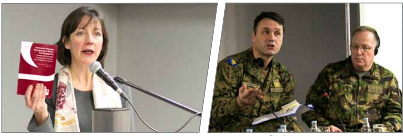
Swiss Ambassador Rauber-Saxer Introducing the Working Paper

Established in 1999, the Small Arms Survey is a global center of excellence whose mandate is to generate impartial, evidence based, and policy-relevant knowledge on all aspects of small arms and armed violence.