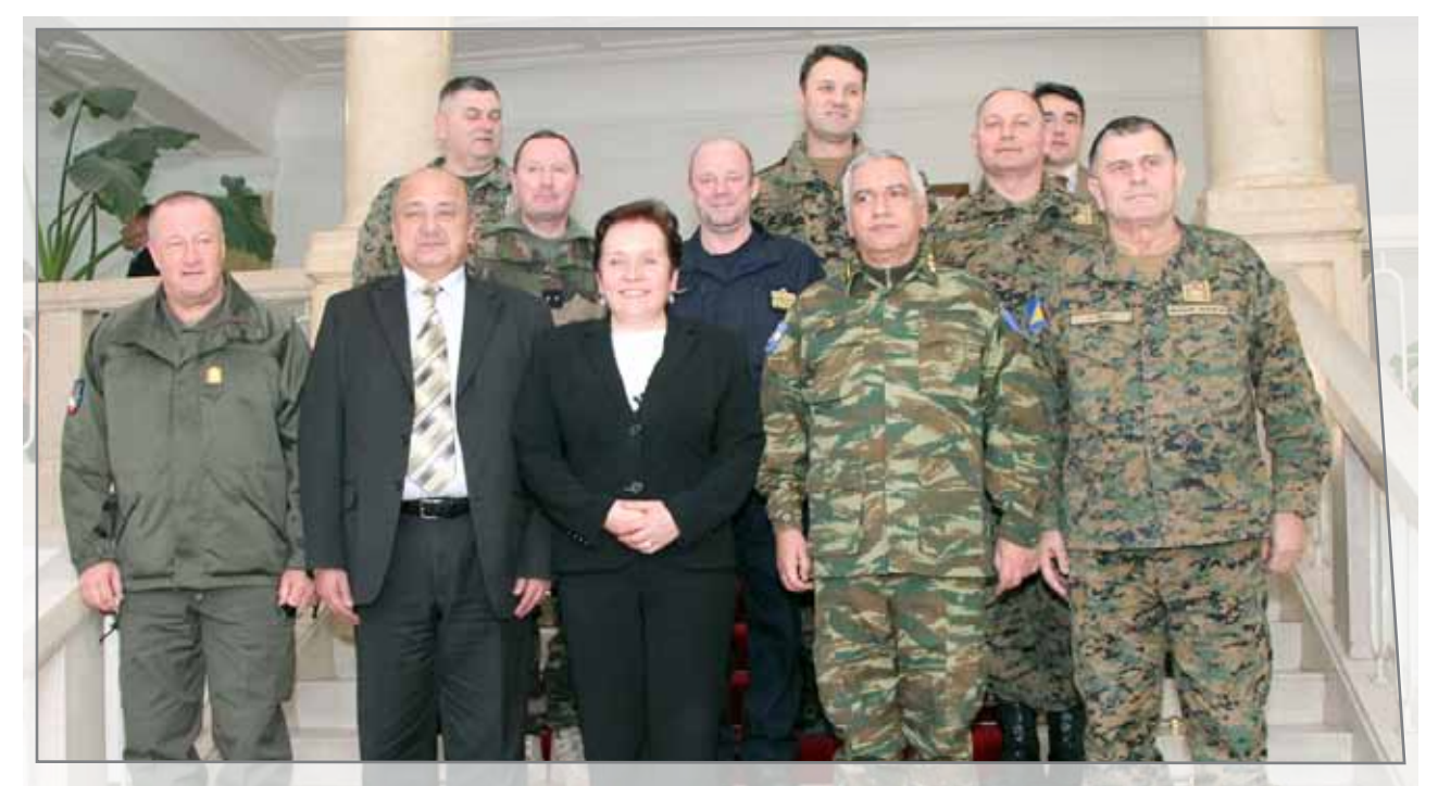
The EUMC Delegation with Minister of Defence Pendes and MoD Staff