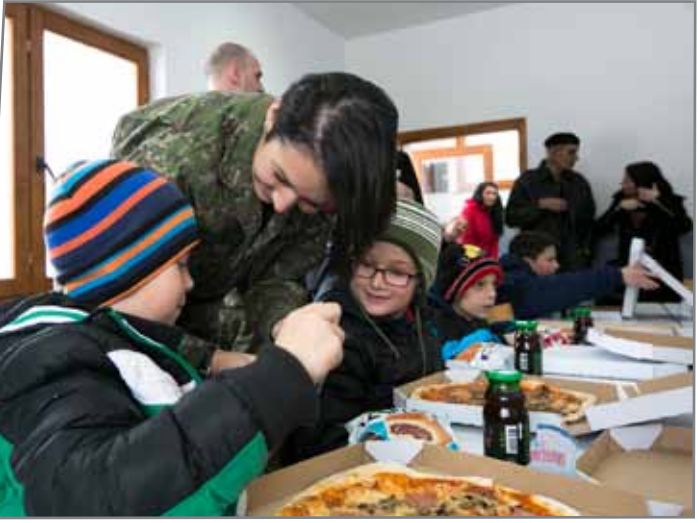
Children from Kamenica receiving their food and gifts.

The primary role of EUFOR's LOT Houses is to maintain good situational awareness throughout Bosnia and Herzegovina. Seven different countries provide the military personnel to man the 17 LOT houses whose members actively interact with the populace to find out the opinions and needs of the population. Charity events like the above, show that the teams are willing to go above and beyond their required duty in order to make a difference in the community.