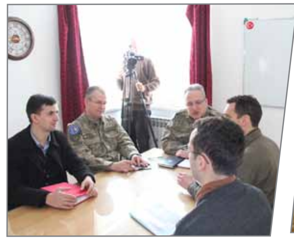
LOT Cdr brief on activities of the day