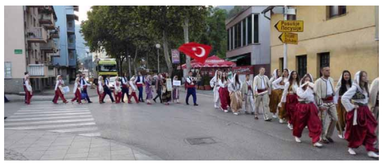
All participants walked down the streets in the cortege walk.

On 7 August 2016, LOT JABLANICA monitored the "12TH INTERNATIONAL DANCING FOLKLORE FESTI-VAL" in JABLANICA. This Folklore Festival is held every year in summer time in JABLANICA. The event was held to perform different traditional dances of all Balkan nations. Dancing is a universal language for different cultures to communicate with each other. Folklore has a key role for cultural understanding and contributing good relations among ethnicities. This event put different cultures and ethnicities together in a peaceful environment by the magical language of dancing.