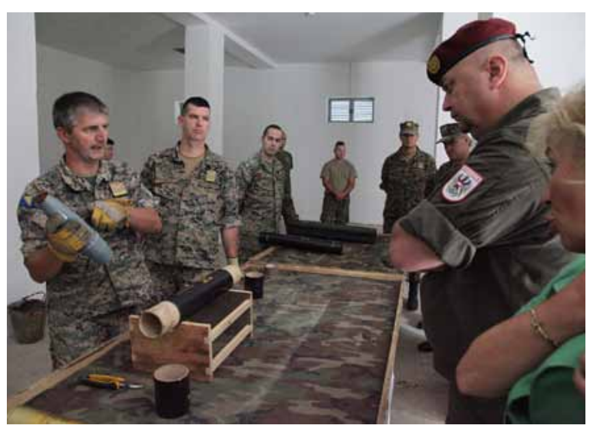
COMEUFOR, Major General Friedrich SCHRÖTTER witnesses the safe disposal of a High Explosive (HE) projectile.