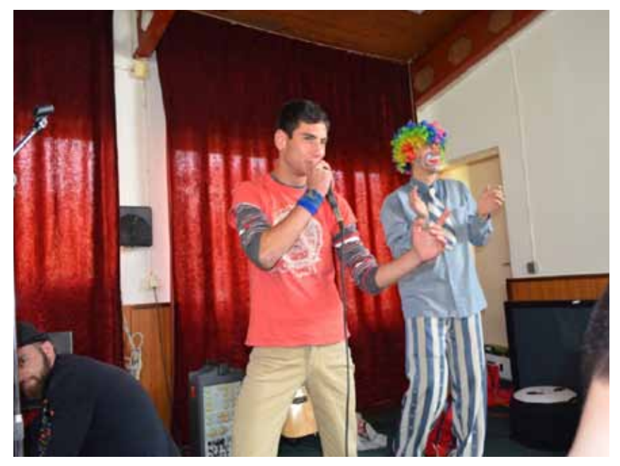
Performance of boy from Institute

Within the projects of this Institution, there are diverse craft sections, workshops in which children and youth take participation as well you may buy their handmade work.