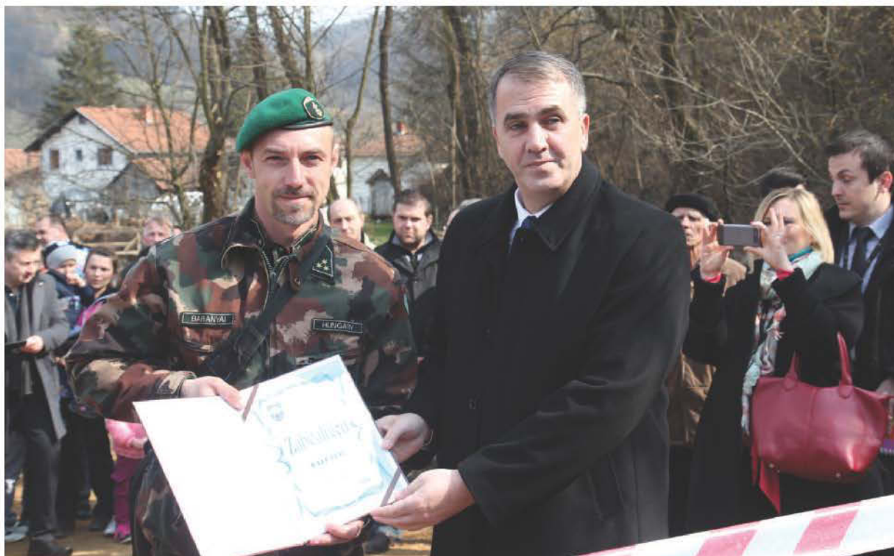
Official opening of the Lukavica Rijeka bridge

On 10 March 2015, the mayor of Lukavica Rijeka invited representatives of the Armed Forces of BiH, EUFOR and UNDP for the official opening ceremony of a bridge in this village near Doboj.