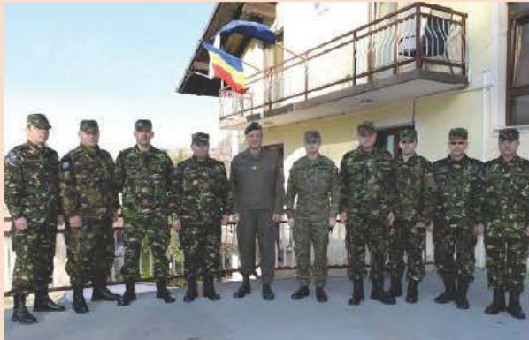
COM EUFOR and LOT Cazin personnel