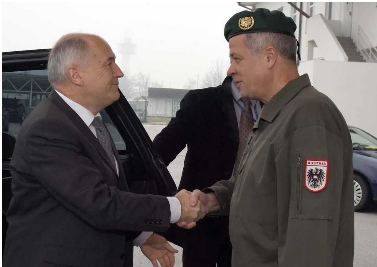
COM EUFOR welcomes the High Representative to EUFOR HQ, Camp Butmir