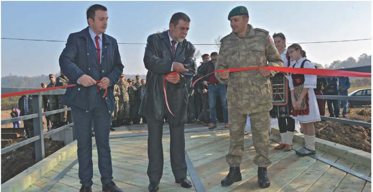
Official opening of the bridge

On 6 November, the municipality of Derventa officially took ownership of a bridge built by a EUFOR and Armed Forces of Bosnia and Herzegovina (AFBiH) team. The transfer of ownership was marked with a ribbon cutting ceremony attended by EUFOR officers and local dignitaries. The bridge, built over the river Ukrina near Donje Detlak, was built as part of a programme run by the EUFOR Capacity Building & Training department, during which engineers from the AFBiH were mentored as they constructed the new bridge. The project to build the bridge was started in July 2015, when a reconnaissance was conducted on the site. Civilian contractors were employed to install the concrete supporting pillars, and on the 19th of October the construction of the bridge itself began.