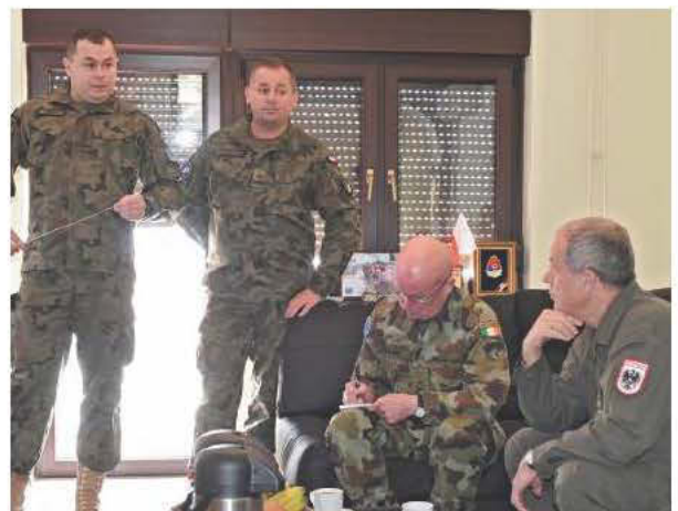
COM EUFOR briefed by the Polish LOT House Commander