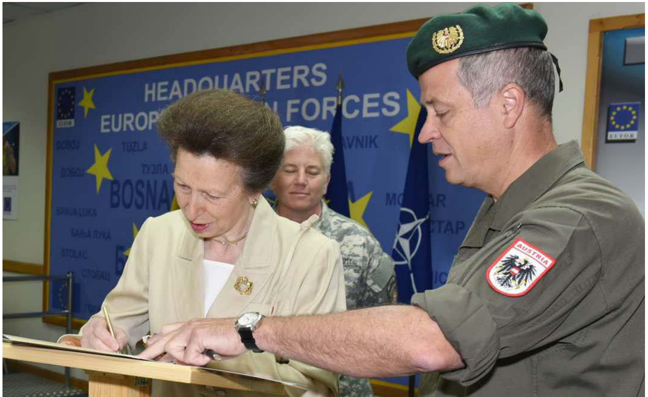
Her Royal Highness Princess Royal signs EUFOR guest book at the entrance of Building 200

On 10 July, Her Royal Highness The Princess Royal visited EUFOR personnel based in Camp Butmir, Sarajevo.