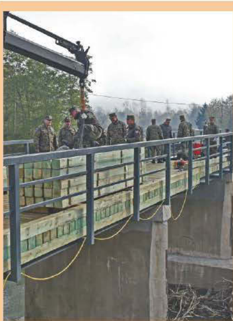
EUFOR train AFBiH in bridge building