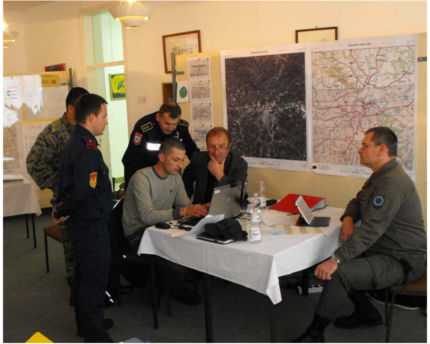
Disaster relief training discussions

On 14 May 2015 the Turkish contingent via its Liaison Observation Team (LOT) in Travnik donated new equipment to the maternity department of Travnik hospital.