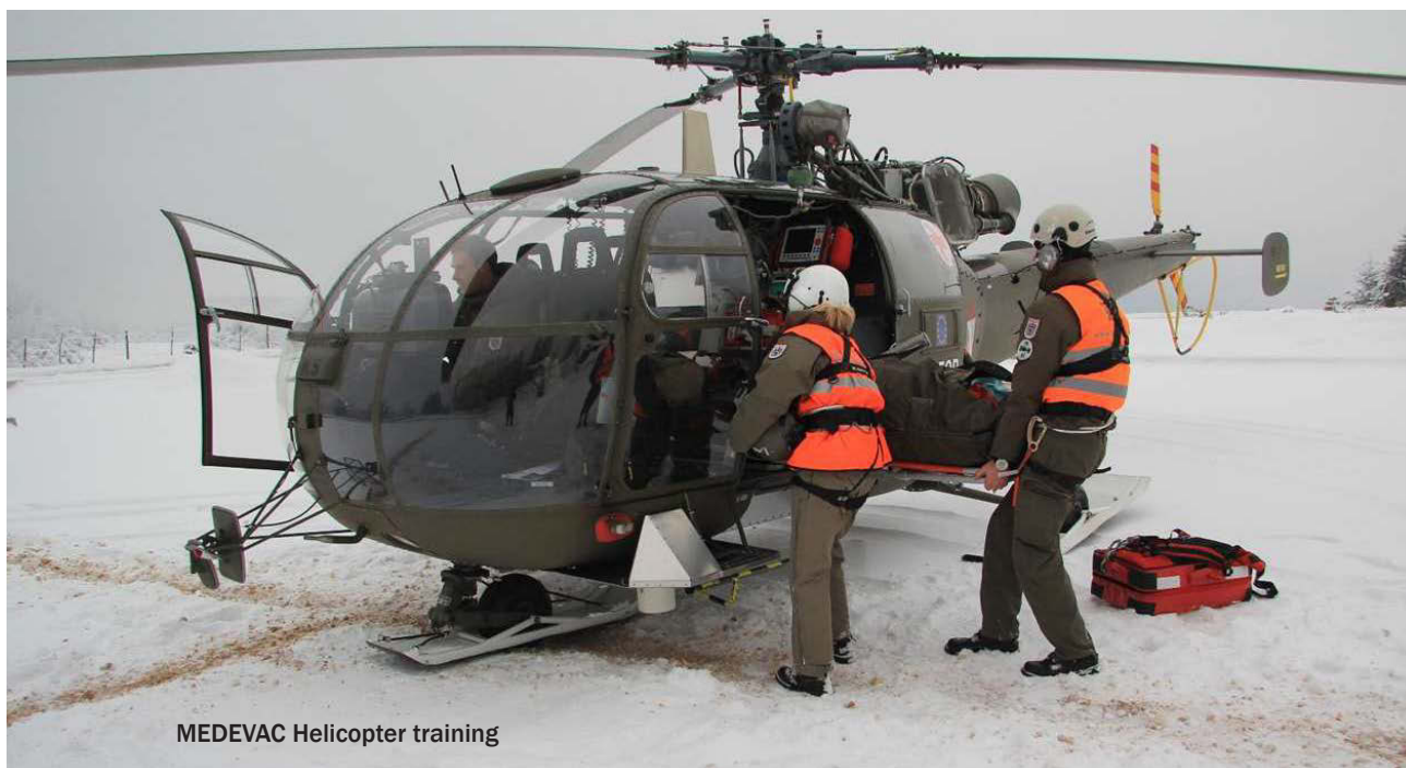
MEDEVAC Helicopter training

At the end of January, the helicopter medevac team (Austria) of EUFOR together with the MNBN conducted an exercise at Mount Trebević. The scenario was that 3 soldiers of the MNBN were injured during a car accident while conducting a patrol. One soldier was fatally injured and two suffered minor injuries.