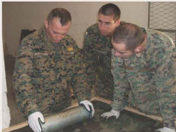
AF BiH soldiers being trained on ammunition handling

Over the course of the training, AFBiH personnel are given the knowledge to safely handle ammunition, visually checking it for signs of damage and aging. They are given the ability to identify ammunition