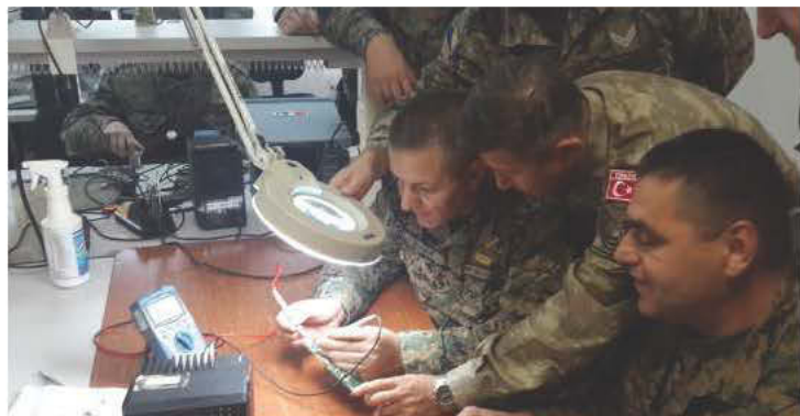
AF BiH soldiers being trained in Radio maintenance

Turkey donated 300 radio communication devices in 2011, which are used in both military and humanitarian emergency situations. This training course was designed to allow the AFBiH students to keep the radio communication devices functioning