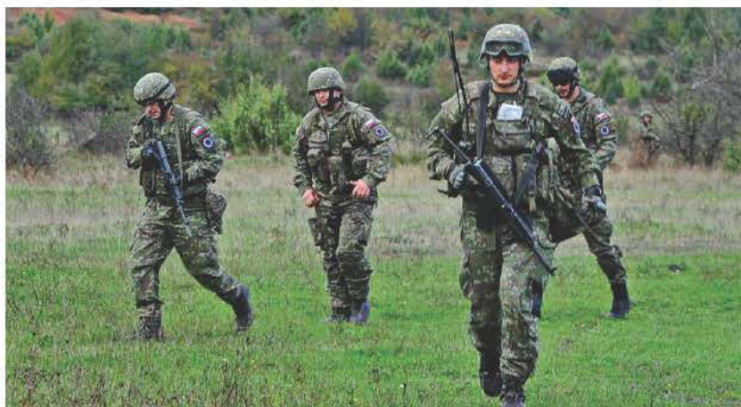
Members of the Slovakian IR Company

The event featured a Live Demonstration, during which the visitors witnessed a display of Peace Support Operations. The scenario for the display included EUFOR