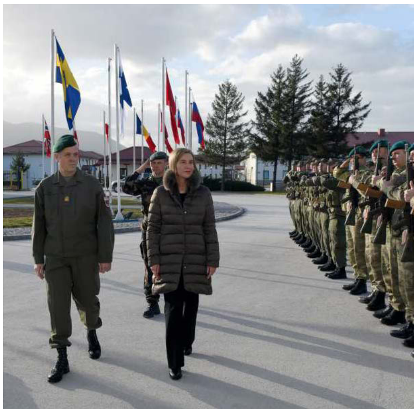
HR/VP Federica Mogherini inspects EUFOR Honour Guard

From 16 - 19 February 2015 The Turkish Platoon of the EUFOR Multinational Battalion (MNBN) conducted peacekeeping training with the Bosnian Armed Forces at Prijedor in the northwest of Bosnia and Herzegovina.