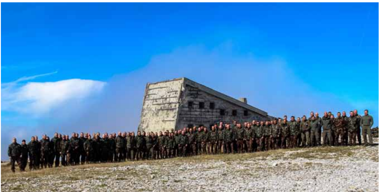
Hungarian MNBN soldiers at the top of Bjelašnica

The Hungarian MNBN Company conducted their walk on the 1st of October. Beginning in cold, foggy conditions they were soon rewarded with clear