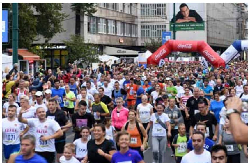
Crowds begin the Sarajevo half marathon