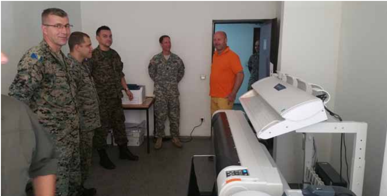
AFBiH course members together with map printing equipment they were trained on

From the 7th of September until the 16th of October 2015, EUFOR conducted five “GEO Courses” for the Armed Forces of Bosnia and Herzegovina (AFBiH) at the Tactical Support Brigade Barracks in Rajlovac. In total 7 personnel from the AF BiH participated successfully.