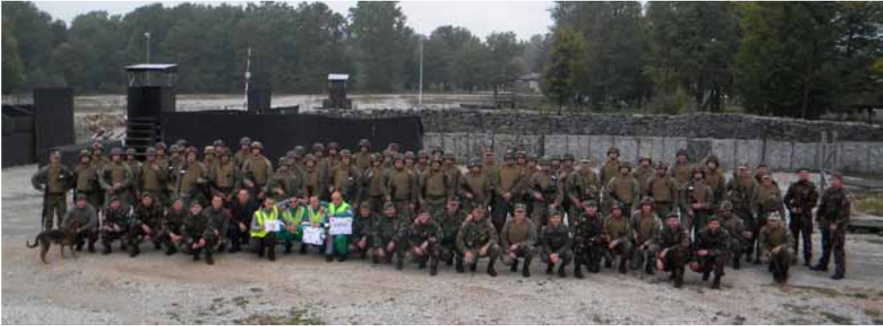
Members of the EUFOR MNBN alongside their AFBiH counterparts

From the 5th until the 9th of October, the Multinational Battalion (MNBN) of EUFOR and infantry from the Armed Forces of Bosnia and Herzegovina (AFBiH) conducted combined training in Dubrave. Led by the Capacity Building and Training branch of EUFOR, the joint training was set up to instruct soldiers tactically in peace support operation techniques.