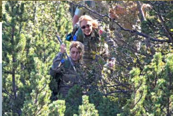
Right and below: MNBN soldiers make their way up the mountain during the march