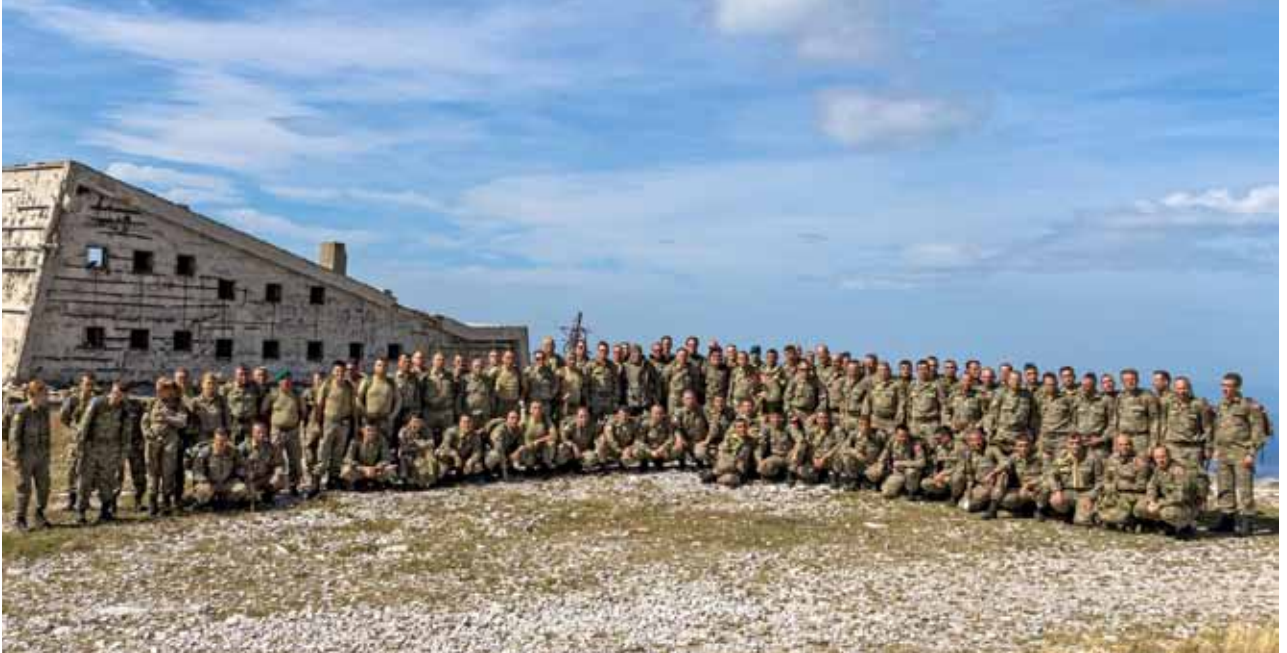
Turkish MNBN soldiers reach the top of Bjelašnica

During September and October the Multinational Battalion conducted two ‘Alpine Marches’, walking in the area around Bjelašnica.