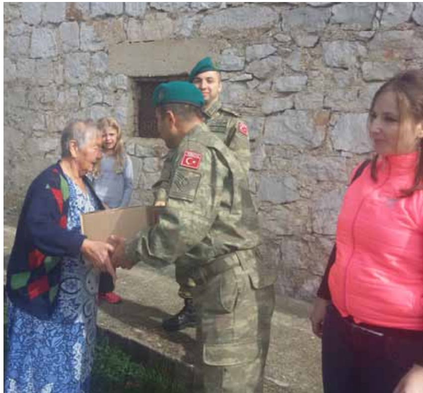
A Turkish LOT House member hands over a food package to a local woman