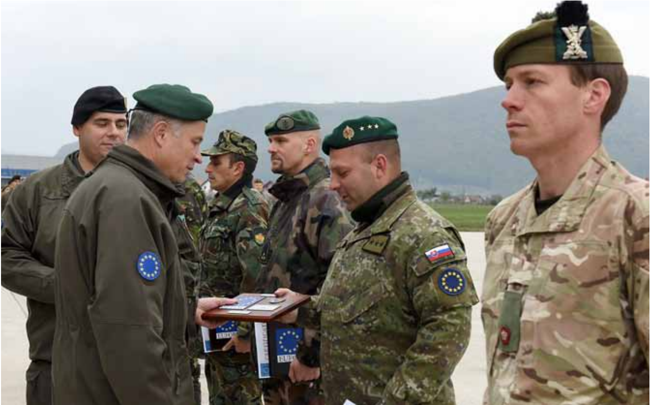
COM EUFOR hands plaques and Certificates of Recognition to leaders during the closing ceremony