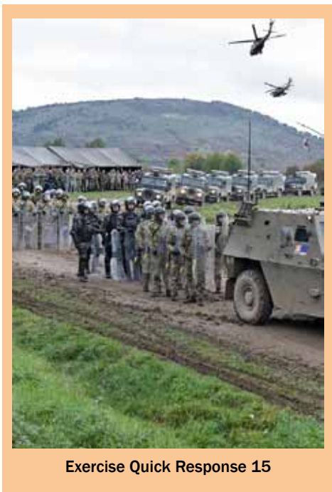
Exercise Quick Response 15

A warm welcome to another edition of EUFOR Forum. September and October have been dominated by Exercise Quick Response 15, with EUFOR personnel from within Camp Butmir and around Europe participating. The Distinguished Visitors Day provided a very public opportunity for EUFOR to display its skills, and was attended by a large number of senior officers and press representatives.