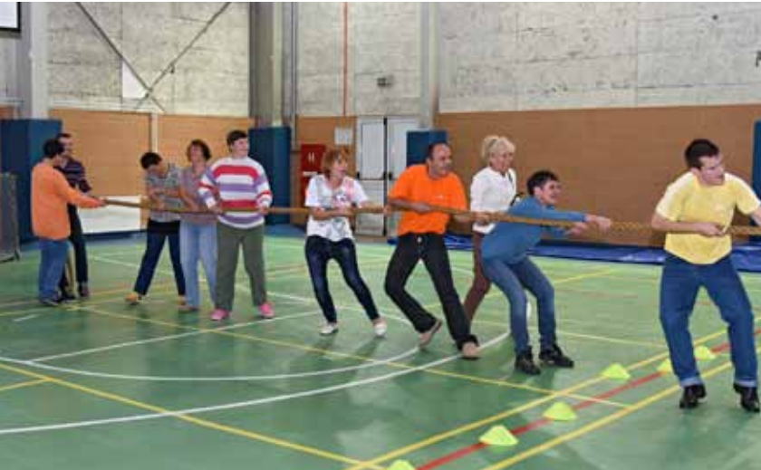
In the gymnasium, the visitors took part in games including tug of war and a football match