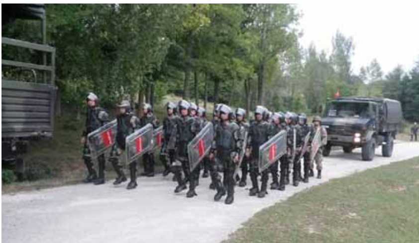
Turkish troops prepare to deploy during the exercise