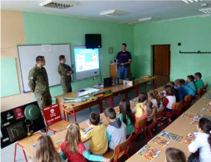
A civilian MRE instructor alongside members of LOT House Foca delivers the training to schoolchildren

On the 29th of September Slovakian personnel of a LOT (Liason and Observation Team) in Foča visited 'Sveti Sava' primary school to deliver MRE (Mine Risk Education) lessons to 62 of the children there. MRE teaches children about the dangers of