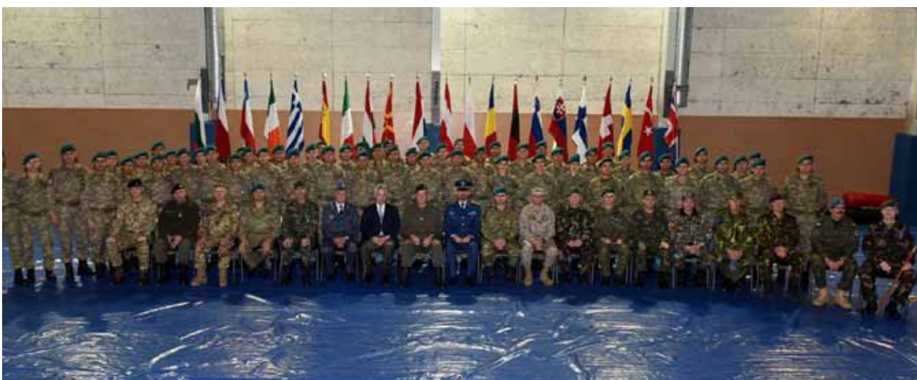
Distinguished guests and medal recipients at the October medal parade