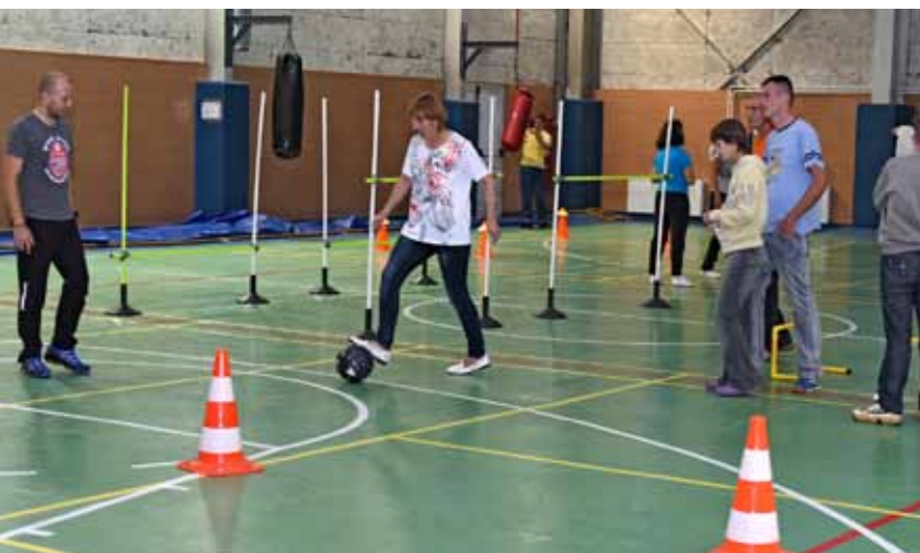
Young people from the institute compete against each other

On the 22nd of September, a group of 16 children and 8 teachers from the Institution for the Protection of Children and Youth in Pazarić visited EUFOR in Camp Butmir. The organisation provides care for disabled children and young people in their area. During the visit the attendees visited the EUFOR helicopter unit and were given live demonstrations of the equipment, witnessing an evacuation drill. During the visit they also had lunch in the DFAC and offered some artworks for sale that the young people had made.