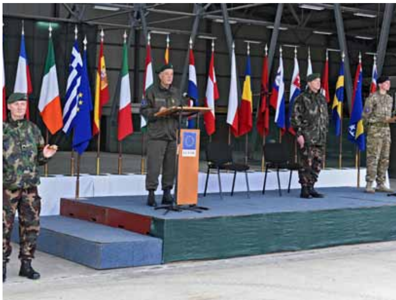
COM EUFOR addresses the parade