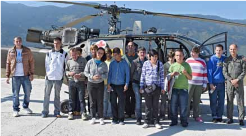
The disabled visitors visiting the EUFOR's Alouette helicopter