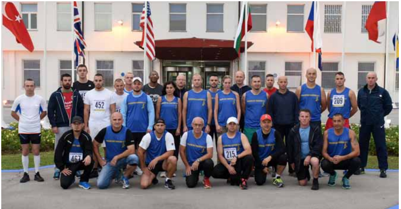
The NATO and EUFOR members prior to taking part in the race

On the 20th of September 28 members of EUFOR and NATO took part in the Sarajevo Half Marathon, running a distance of over 21 kilometers. The event has been run since 2007, and this year a record 1,500 participants from 32 countries took part in different