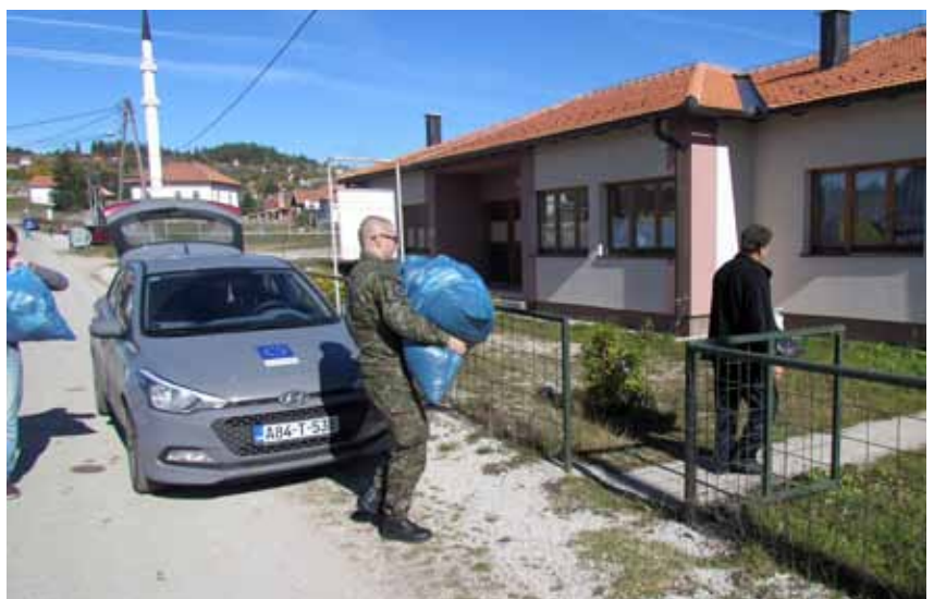
The clothes being taken into the local community centre