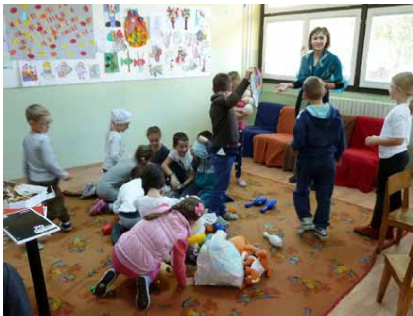
Children of the Sveti Sava school enjoying the new toys