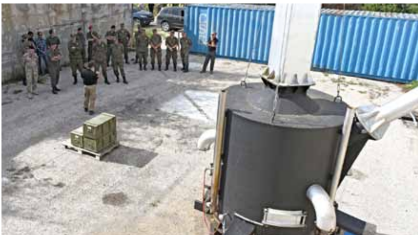
A small arms ammunition furnace at Glamoc