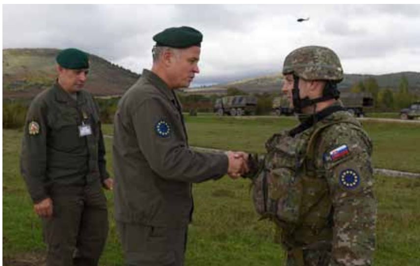
COM EUFOR together with a Slovakian soldier