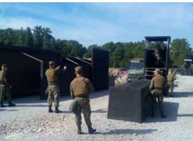
Running a vehicle checkpoint