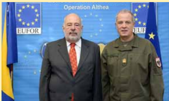
COM EUFOR with the Brazillian Ambassador

Poland contributes personnel in the headquarters of EUFOR as Military Police within Camp Butmir, and also contributes to the Capacity Building & Training effort. Polish personnel instruct and mentor the Armed Forces of Bosnia and Herzegovina in areas such as the movement of military vehicles. This assists them as they develop their ability to conduct Peace Support Operations abroad and support authorities in disaster relief within Bosnia and Herzegovina.