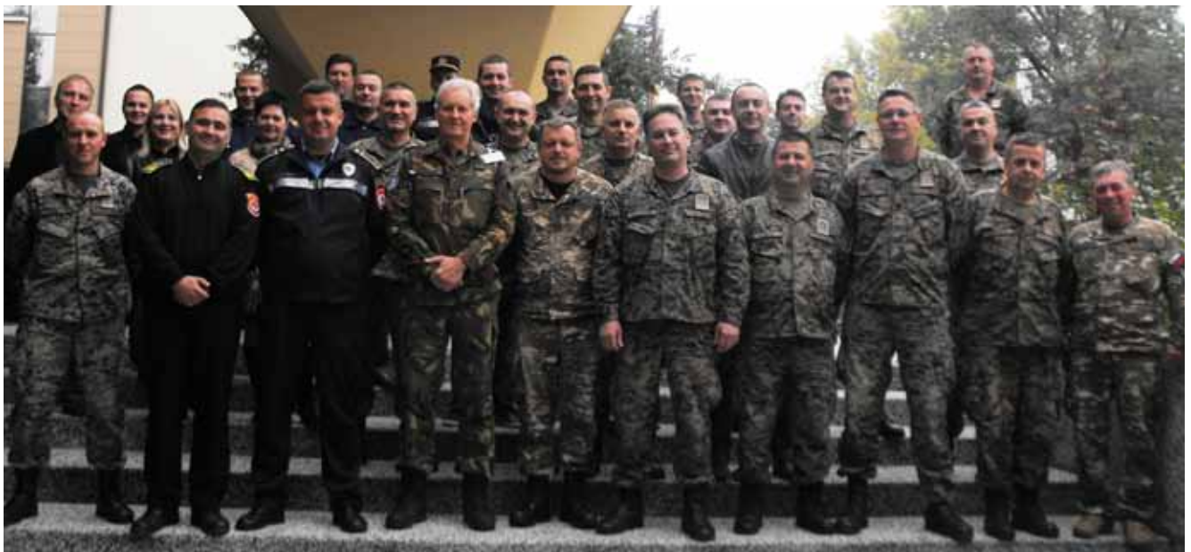
Members of the EUFOR Mobile Monitoring Team alongside AFBiH and civil authorities