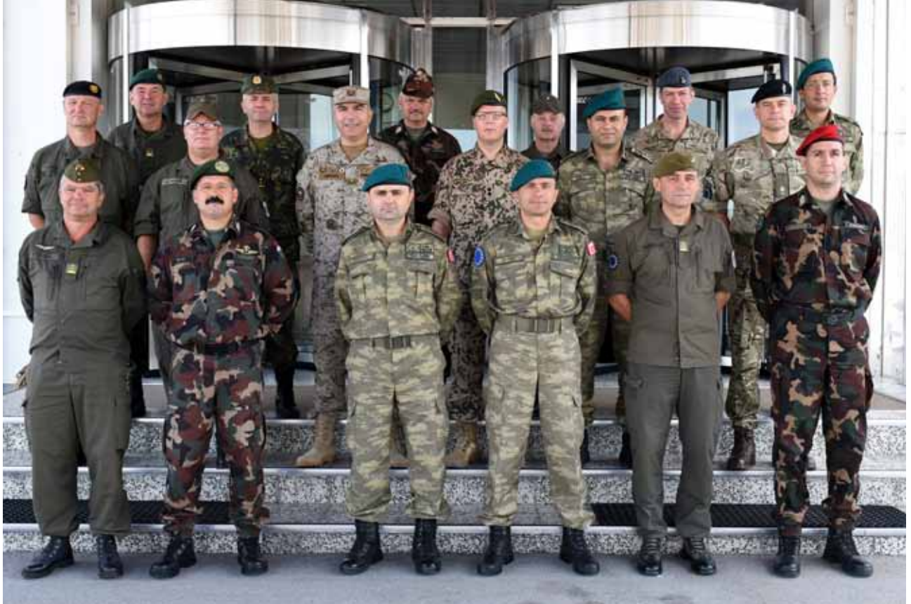
New EUFOR members taking part in Key Leader Training