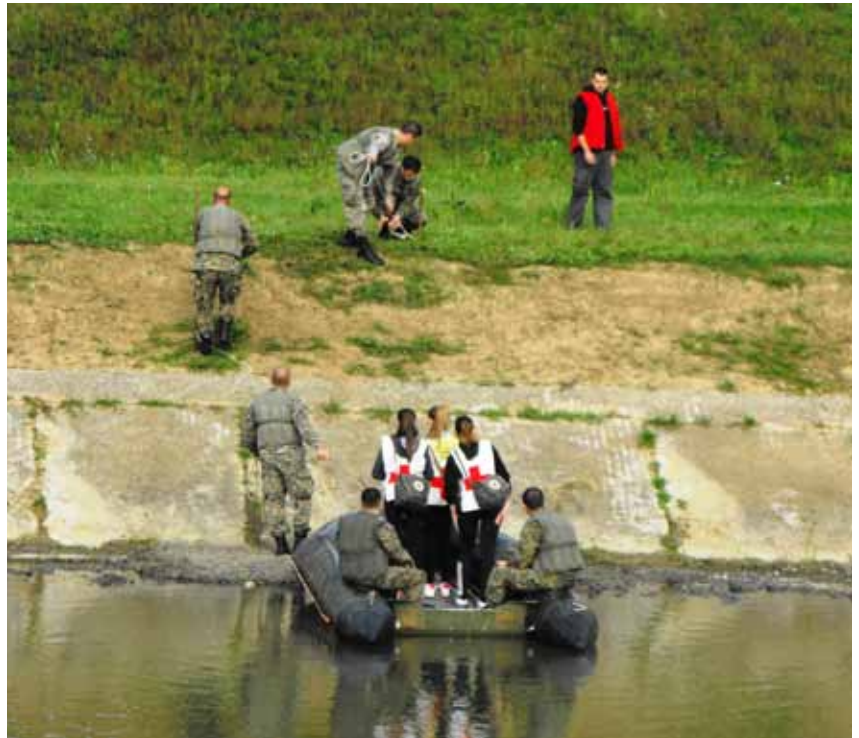
AFBiH soldiers assist a medical team during at a river crossing

As the exercise started, a Crisis Centre was formed in the municipality of Derventa. The Crisis Centre responded to exercise incidents and maintained situational awareness, based on the real environment of the Derventa area. Within the Crisis Centre