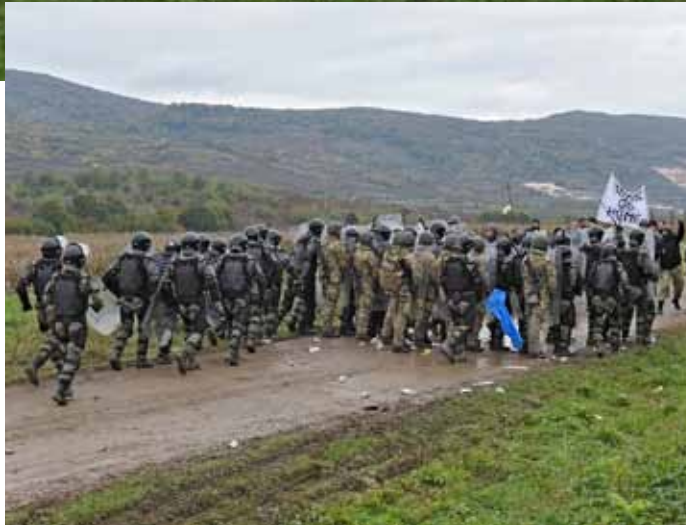
UK and Slovakian soldiers conduct Crowd Riot Control

The training was built around a fictional scenario which required the international force to conduct peace support operations in the host nation.