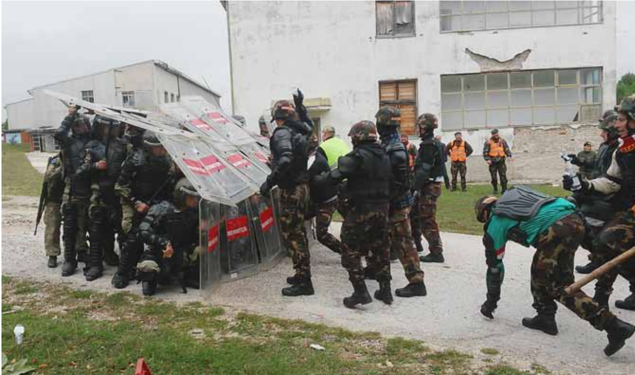
Hungarian soldiers imitate rioting civilians as they attack the Turkish Crowd and Riot control troops

On the 7th of September Turkish and Hungarian soldiers of the Multinational Battalion conducted training in the former military barracks of Kalinovik. The training was based around a fictitious scenario in which the Kalinovik barracks was