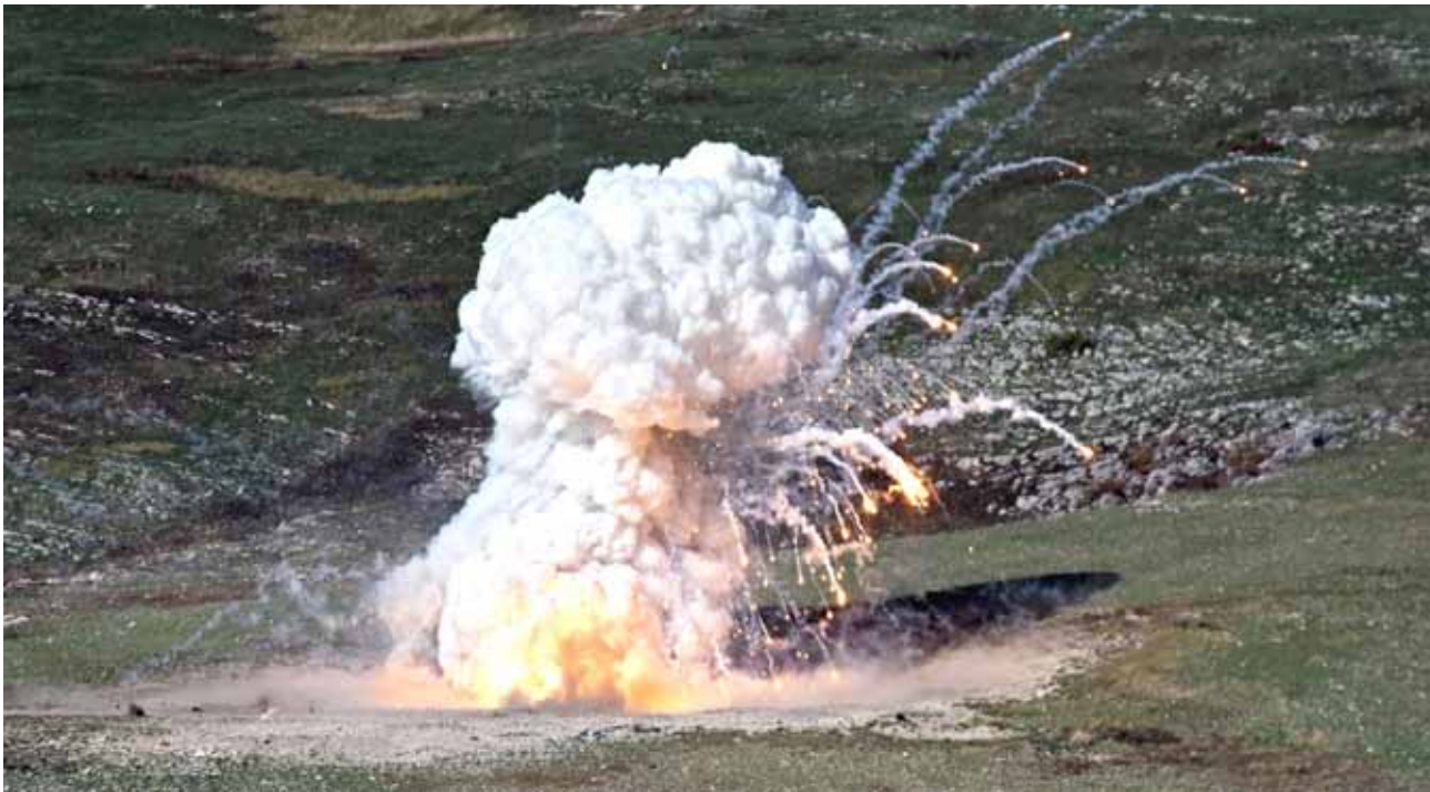
Aircraft bombs being destroyed on the Glamoc range

On Wednesday the 16th of September COM EUFOR Major General Johann Luif visited an ammunition disposal site in Glamoc. During this visit he witnessed the destruction of different types of weapon, ranging from aircraft bombs to small arms ammunition. The destruction of