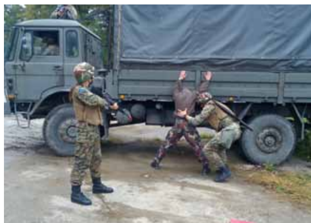
AFBiH soldiers carrying out checkpoint drills