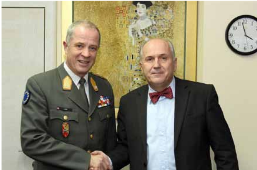
High Representative for Bosnia and Herzegovina, Ambassador Valentin Inzko