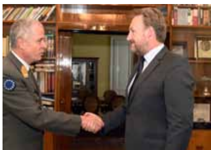
Member of the Presidency, Bakir Izetbegović