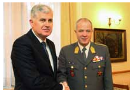
Member of the Presidency, Dragan Čović