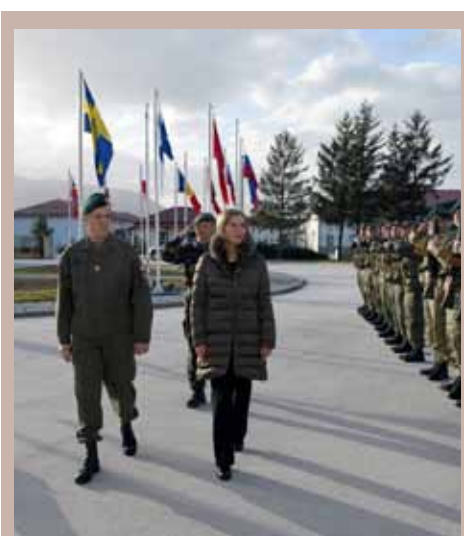
HR/VP Federica Mogherini visits EUFOR HQ

EUFOR Mobile Mentoring Team and AFBiH engineers work on bridge construction in Lukavica Rijeka 12