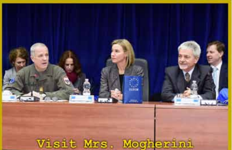
Visit Mrs. Mogherini