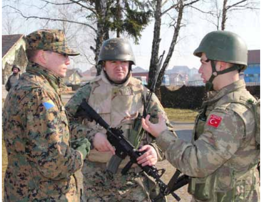
A EUFOR Turkish contingency soldier working alongside a member of the AF BiH

This was the first of 9 platoon-level combined training exercises due to be held in 2015, the exercises are conducted throughout BiH. The exercise included construction and manning of check points and convoy training. Lieutenant