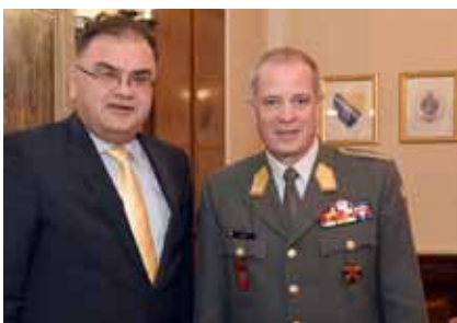
Chairman of the BiH Presidency Mladen Ivanić