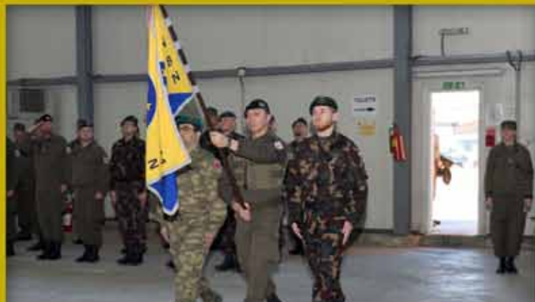
Change of Command MNB