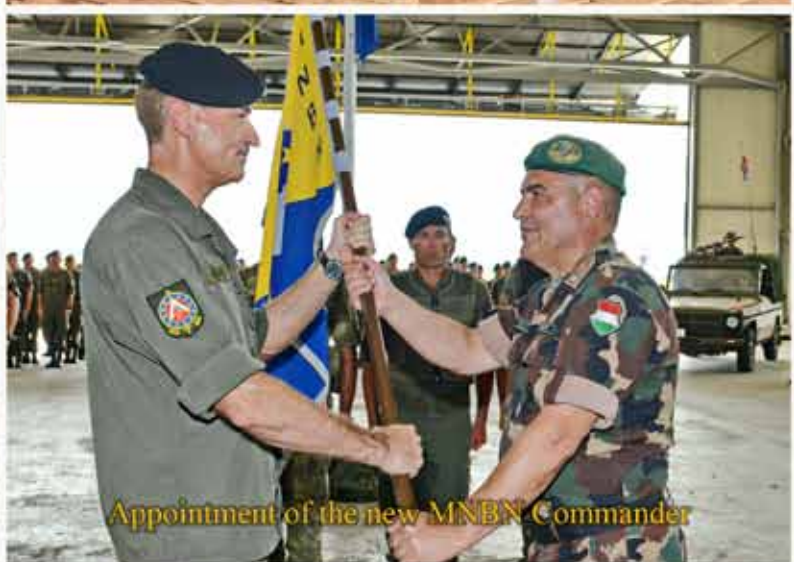
Appointment of the new MNBN Commander