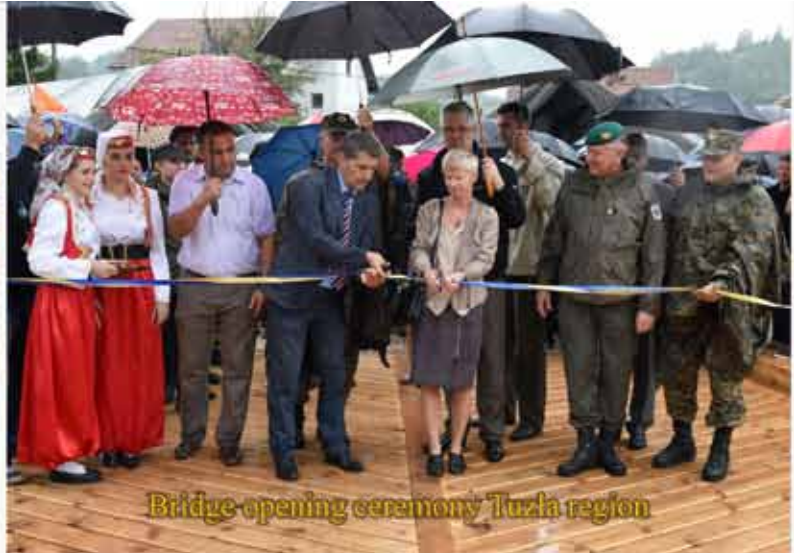
Bridge opening ceremony Tuzla region