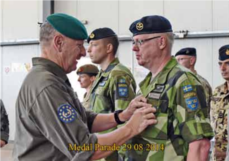
Medal Parade 29 08 2014