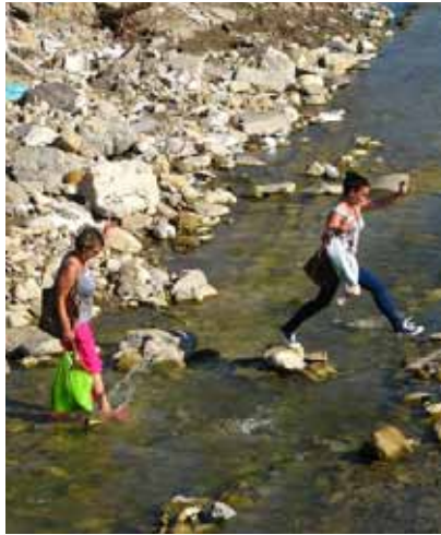
Top: Locals crossing Solina river. Right: Cutting steelangle