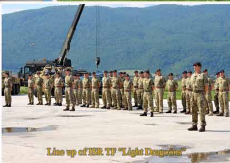
Line up of ISR TF "Light Dragons"