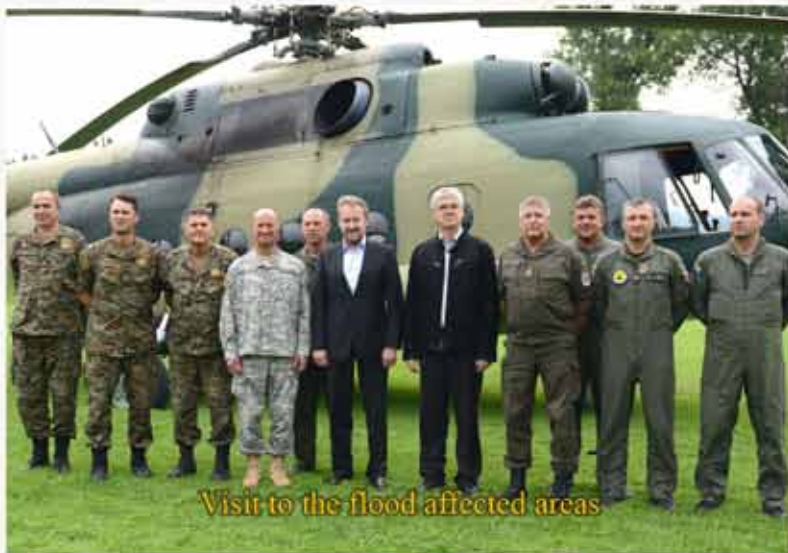
Visit to the flood affected areas