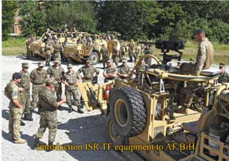
Introduction ISR TF equipment to AF BiH