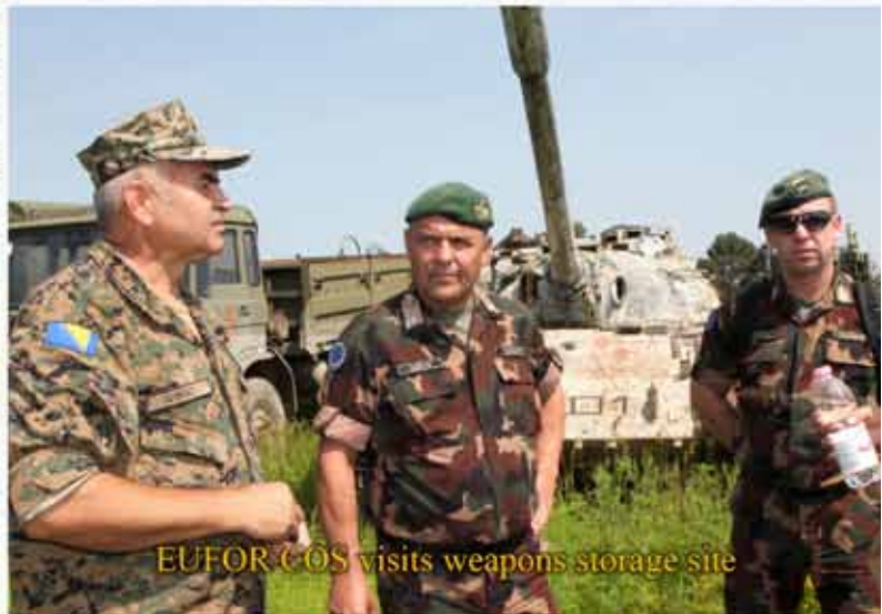
EUFOR COS visits weapons storage site