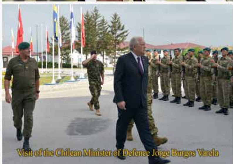
Visit of the Chilean Minister of Defence Jorge Burgos Varela