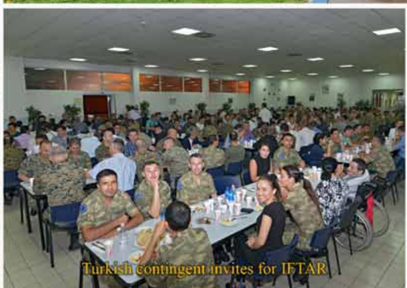
Turkish contingent invites for IFTAR