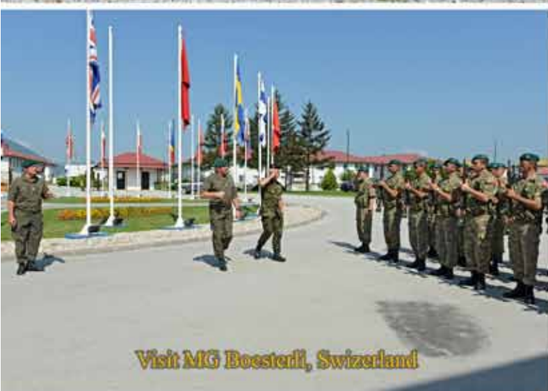
Visit MG Boesterli, Switzerland