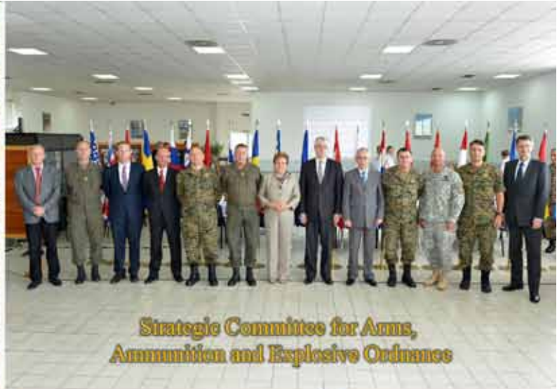
Strategic Committee for Arms, Ammunition and Explosive Ordnance