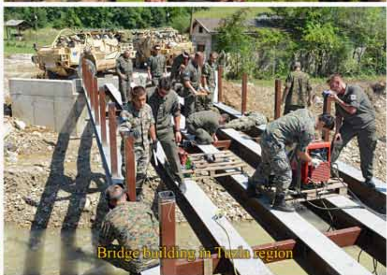
Bridge building in Tuzla region