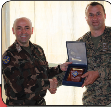
EUFOR strengthens cooperation with AF BiH