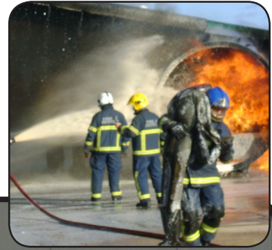
Fire Fighter Training Manchester UK