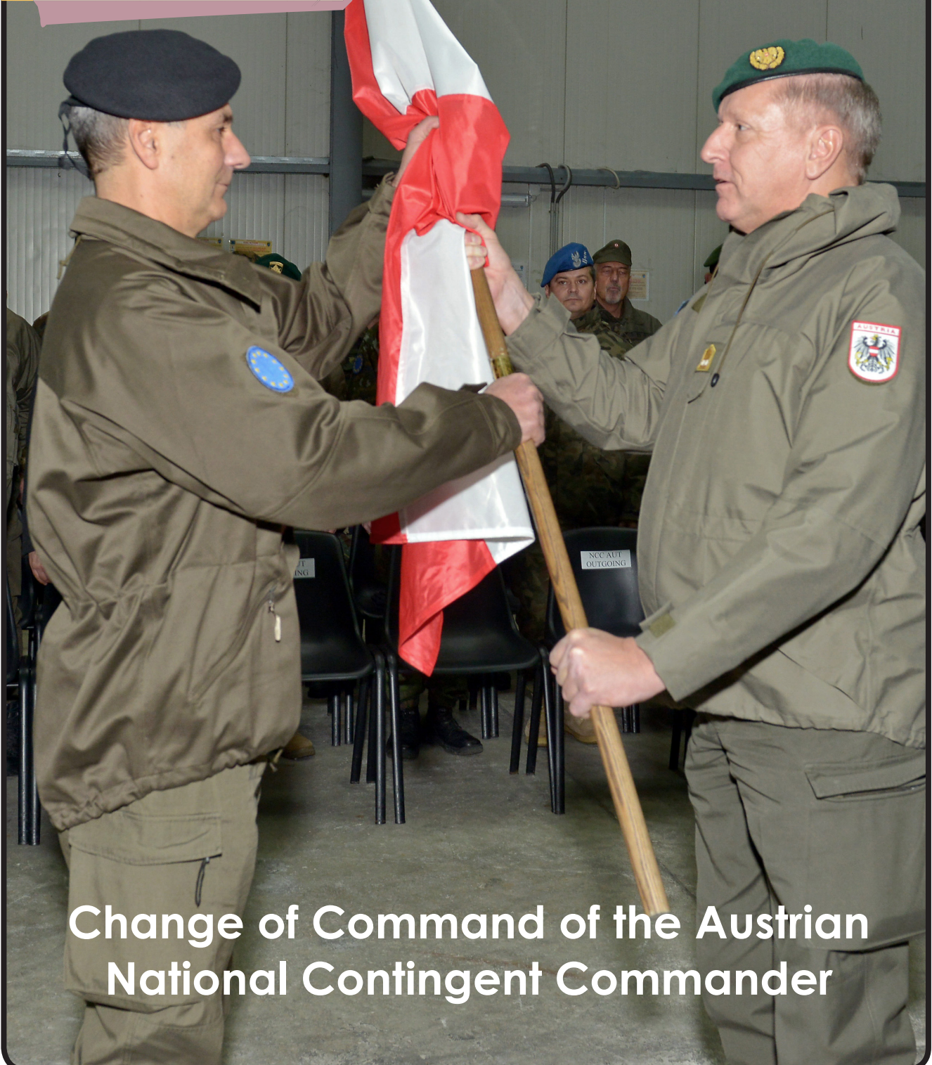
Change of Command of the Austrian National Contingent Commander