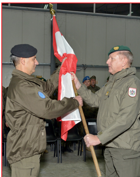
Change of Command of the Austrian National Contingent Commander

EUFOR Capacity Building and Training activities remain our main focus 18