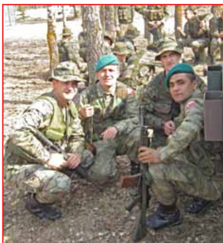
Joint Training with the AFBiH