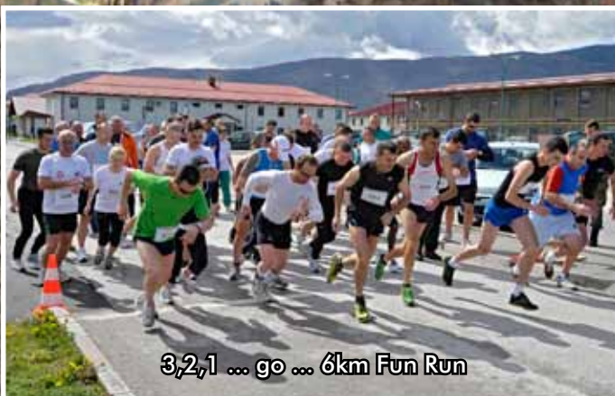
3,2,1 ... go ... 6km Fun Run