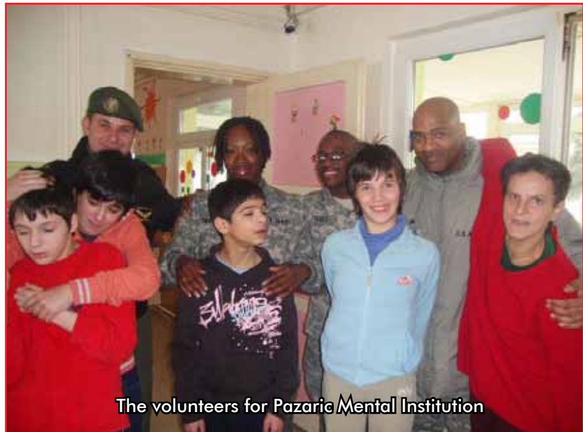
The volunteers for Pazarić Mental Institution

Members of the support group try to visit Pazarić at least twice a month. The residents of Pazarić don't have it easy and they are very happy just to receive visits which bring some variety into their otherwise very monotonous daily routine. The institute is short of funds, equipment