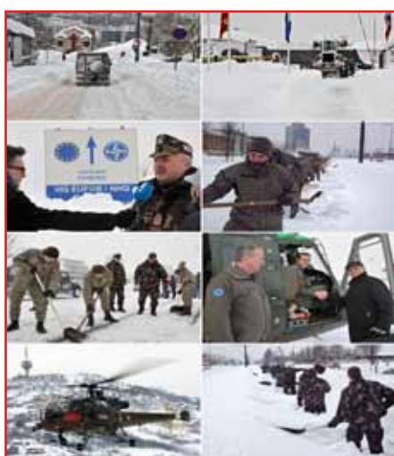
EUFOR support to BiH during state of emergency