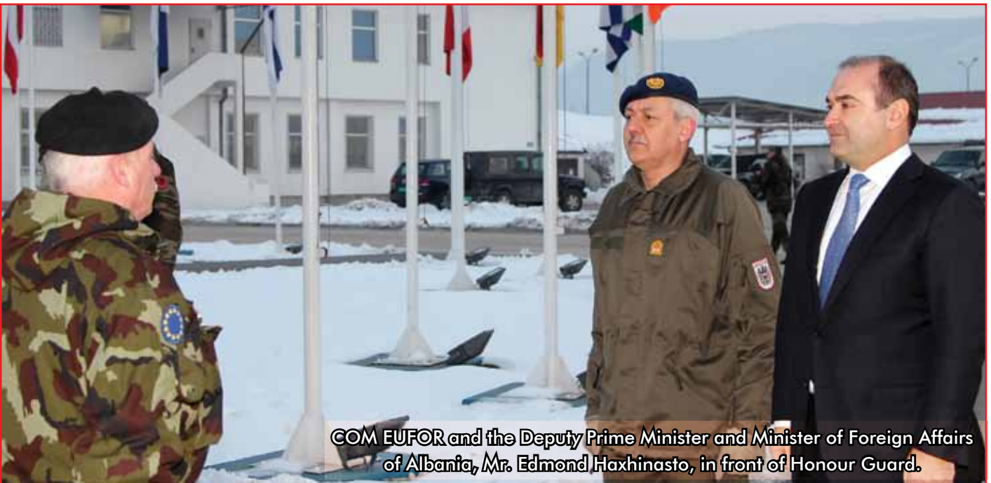
COM EUFOR and the Deputy Prime Minister and Minister of Foreign Affairs of Albania, Mr. Edmond Haxhinasto, in front of Honour Guard.