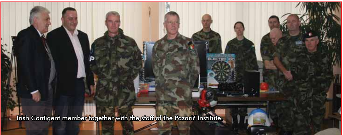
Irish Contingent member together with the staff of the Pazaric Institute.