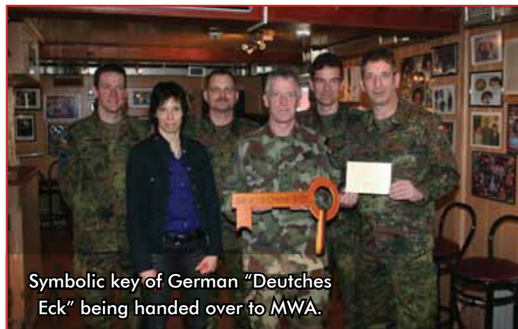
Symbolic key of German “Deutsches Eck” being handed over to MWA.

In late 2010, Germany announced to reduce its contribution to the Operation ALTHEA with up to 15 soldiers remaining in the mission after March 2011. Currently there are 110 German soldiers inside the theatre. The planned restructuring of the German contingent will begin on the 15th of February, when the four German LOT-Houses in Konjic, Ilidza, Gorazde and Foca, as well as the German elements of the RCC will be relieved of their duties. From this point on,