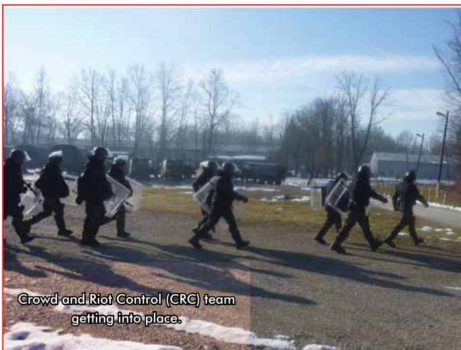
Crowd and Riot Control (CRC) team getting into place.

tional Criminal Tribunal for the former Yugoslavia (ICTY) and Local Law Enforcement Agencies in the search and capture of Persons Indicted For War Crimes (PIFWCs).