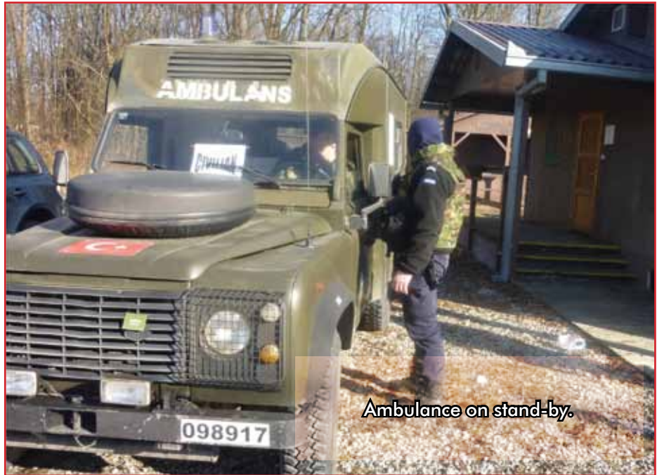
Ambulance on stand-by.