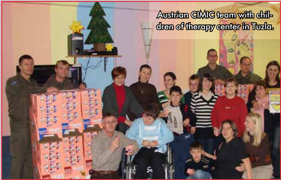
Austrian CIMIC team with children of therapy center in Tuzla.