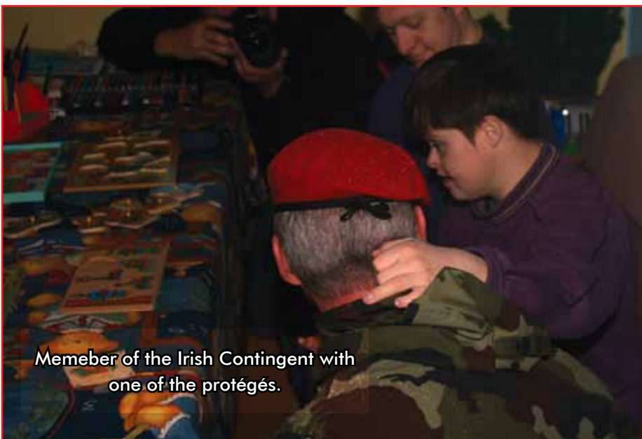
Member of the Irish Contingent with one of the protégés.

The outgoing Irish Defence Forces Contingent organized the delivery of a van load of gifts to the Pazaric Institution dedicated to the care of mentally handicapped protégés, as their guests are known.