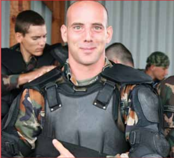
Hungarian Soldier in riot gear.