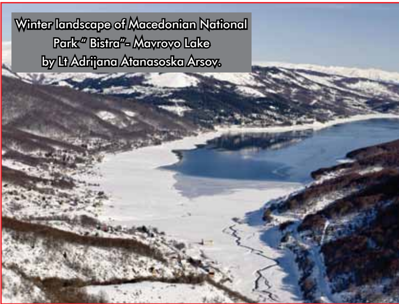
Winter landscape of Macedonian National Park " Bistra"- Mavrovo Lake by Lt Adrijana Atanasoska Arsoy.