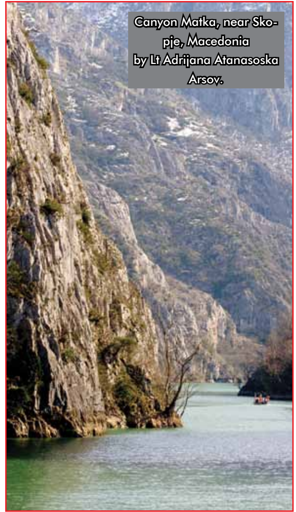
Canyon Matka, near Skopje, Macedonia