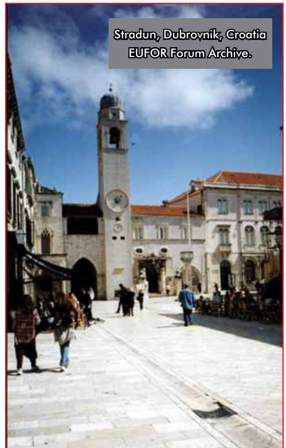
Stradun, Dubrovnik, Croatia EUFOR Forum Arçhiye.