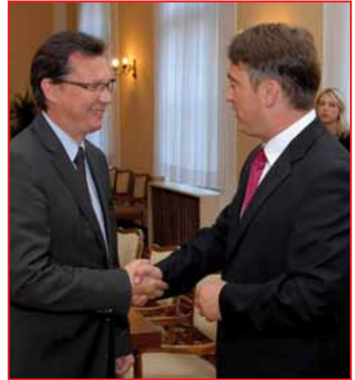
Mag. Norbert Darabos with member of the Presidency of BiH, Mr. Zeljko Komsic.

A visit to the childcare house KORACI NADE (Steps of Hope) completed the visit in Tuzla. The delegation then flew to Potocari where they were introduced to the Memorial Centre. Mag. Norbert Darabos added his note in the book of condolences. A visit to the Austrian Liaison and Observation House (LOT) in Bratunac and a dinner with Austrian soldiers in Camp Butmir completed the second day of the visit.