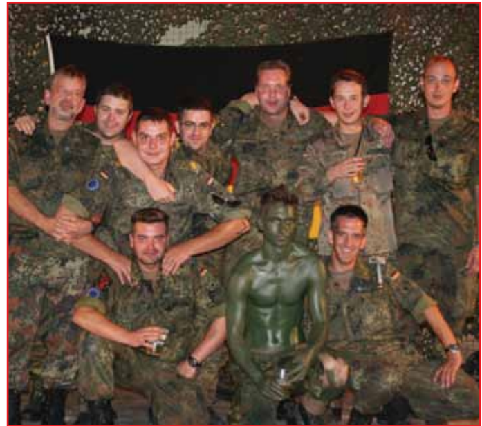
The Incredible Hulk and his friends.

During the ceremony, the German contingent introduced itself by performing short plays to show