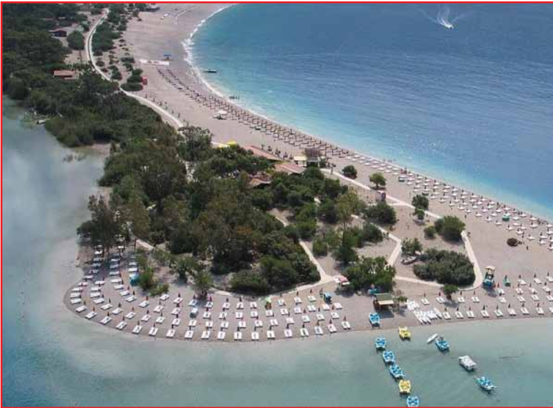
Oludeniz, Fethiye, Turkey