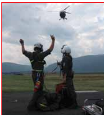
On the front page: Austrian MEDEVAC is ready to hook the winch to the helicopter.

The Month of the Ramadan "Better than a 1000 months" 16