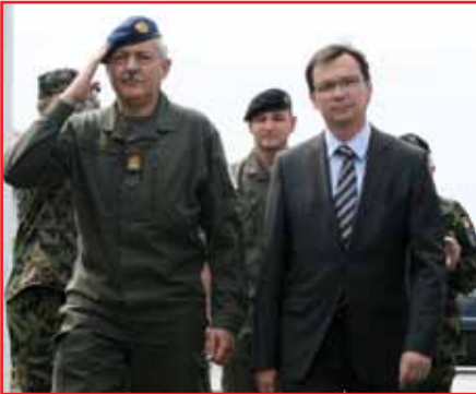
Honor guard paraded for the Minister.