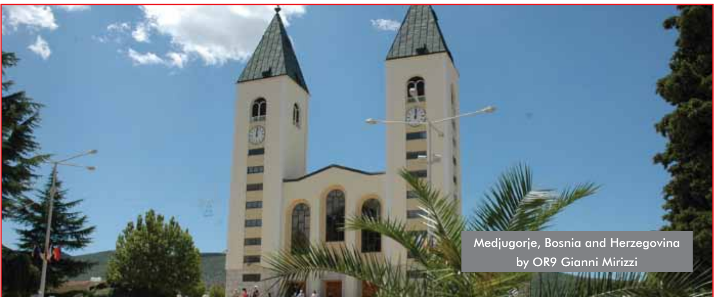
Medjugorje, Bosnia and Herzegovina