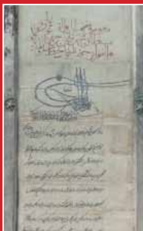
Ahd-Namah Of Sultan Mehmed II