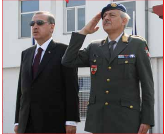
Mr. Recep Tayyip Erdoğan, Prime Minister of the Republic of Turkey and COM EUFOR, Major General Bernhard Bair.

On 11th July 2010, VIP representatives from the Republic of Slovenia, the Kingdom of Belgium, the General of Council of Europe, the Republic of Turkey, Hungary, France, the Kingdom of Netherlands, and the United Kingdom visited Camp Butmir, EUFOR HQ.