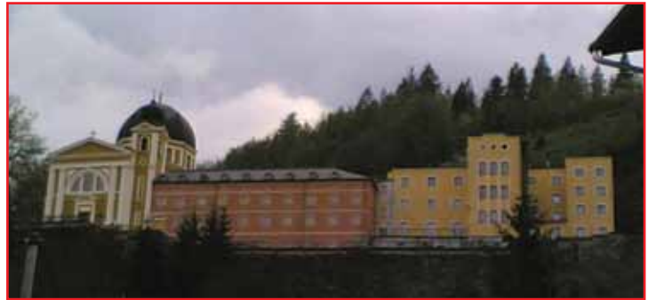
700 years old Franciscan monastery "Holy Spirit" in Fojnica

The legend says that when the Ottoman's conquered Bosnia and Herzegovina they found an empty country with very few people remaining in their properties. Sultan Mehmed II Fatih summoned the Franciscan priests, who explained that the people were afraid and the