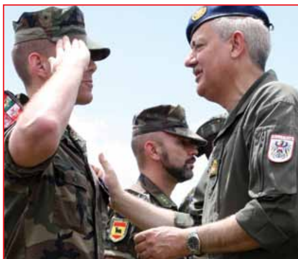
COM EUFOR decorating a Spanish soldier

The ambassador mentioned in a deeply felt speech, the pride that he, as a Spaniard, felt to check on the spot, the outstanding work of the Spanish Armed Forces, helping to restore