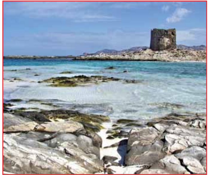
Spiaggia della Pelosa on Sardinia, Italy