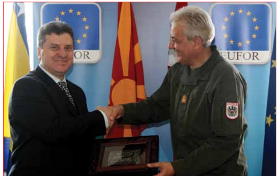
H.E. Mr. Gjorge Ivanov, President of the former Yugoslav Republic of Macedonia with COM EUFOR.