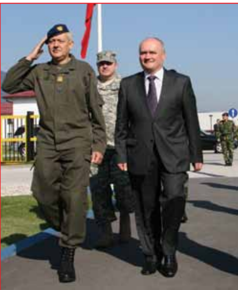
COM EUFOR with Dr. Csaba Hende, Minister of Defence of Hungary.