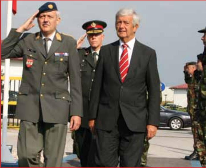
COM EUFOR with Mr. Eimert van Middelkoop, Minister of Defence of the Kingdom of Netherlands