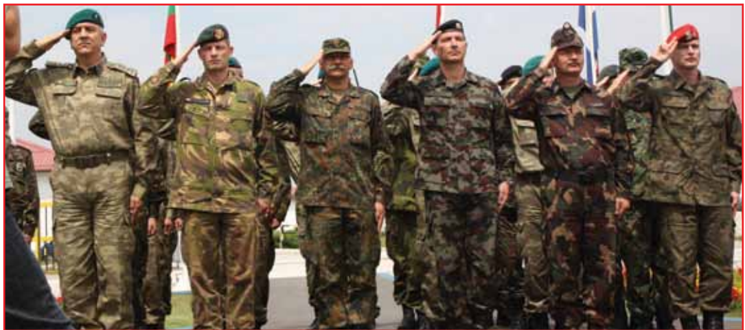
Training and Capacity Building Division on Parade.