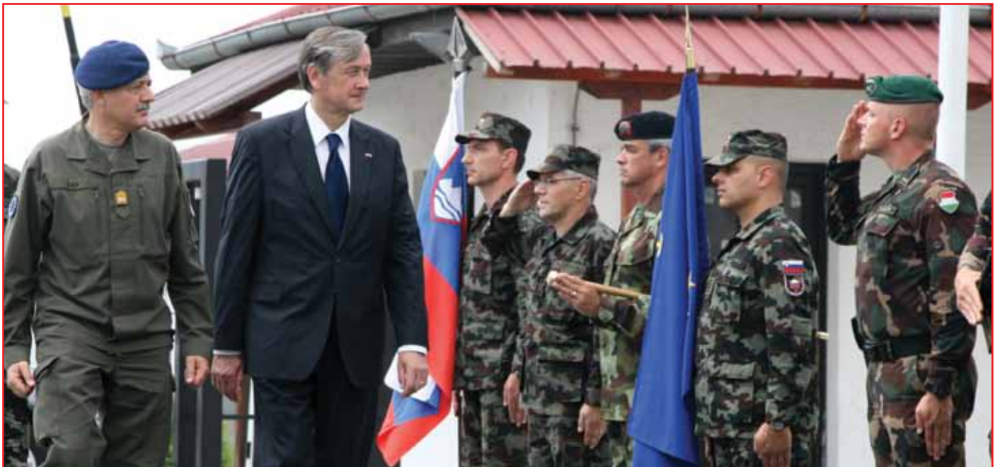
COM EUFOR with Dr. Danilo Türk, President of the Republic of Slovenia.