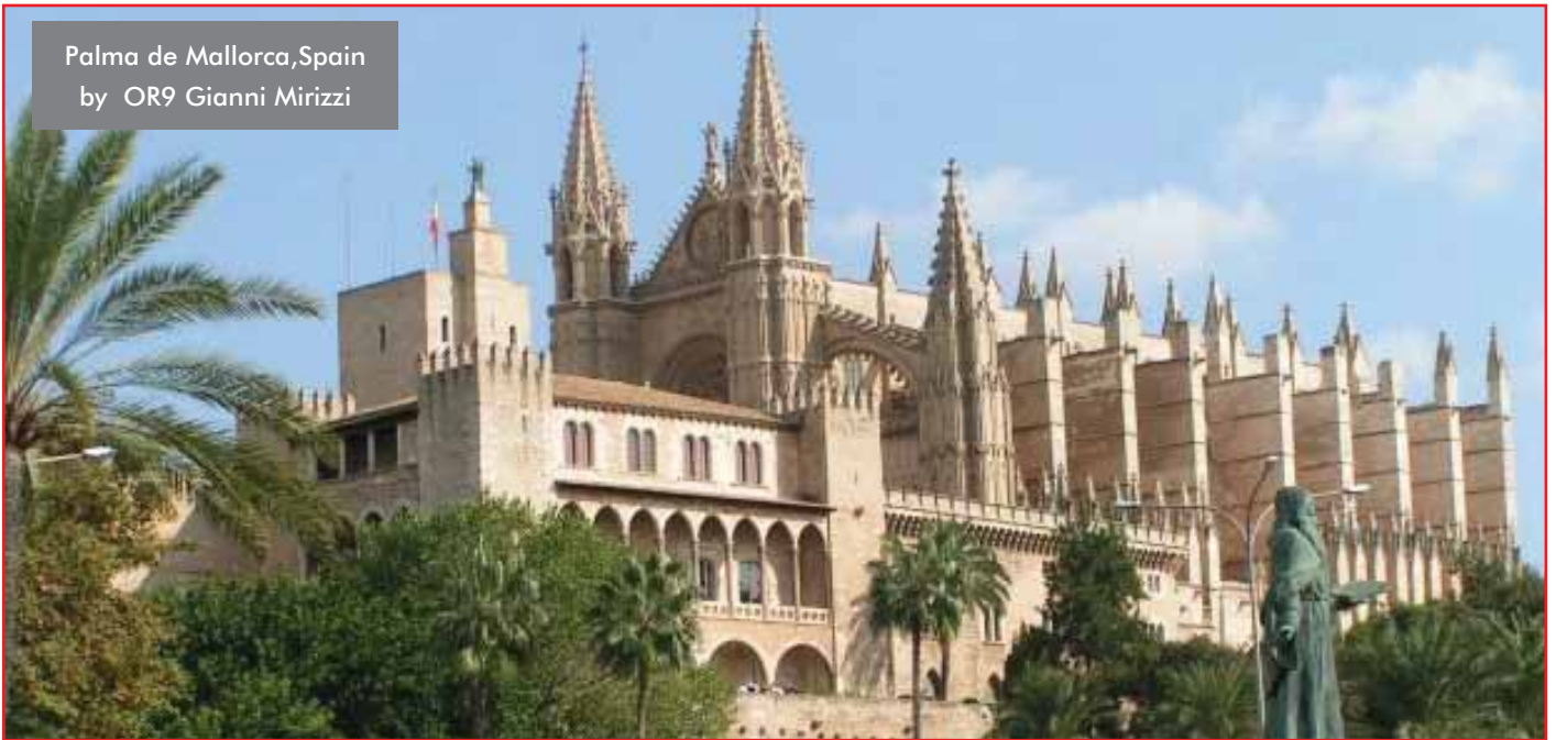
Palma de Mallorca, Spain