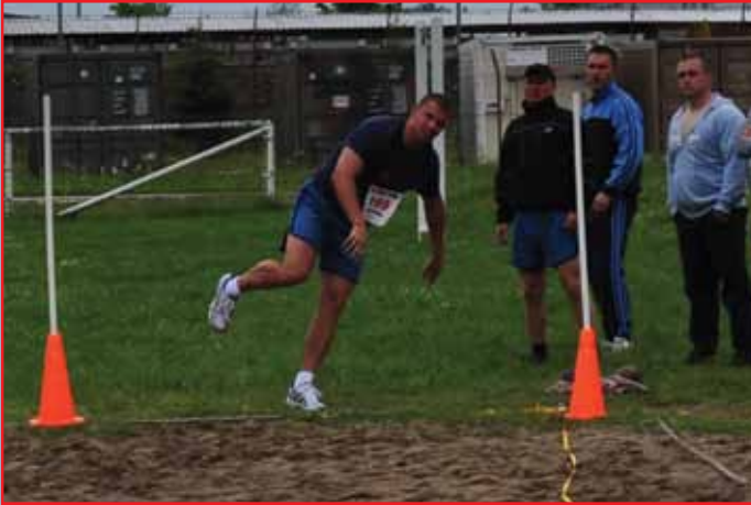
The competition involved many disciplines, including shot putt..