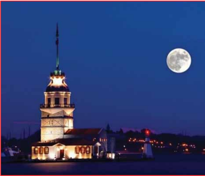
Maiden's Tower in Istanbul, Turkey