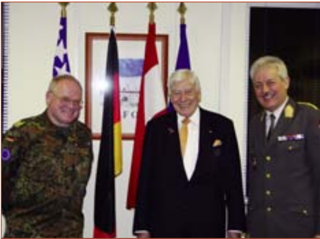
◆ COM EUFOR and COS EUFOR with former HR in BiH, Mr. Christian Schwarz-Schilling