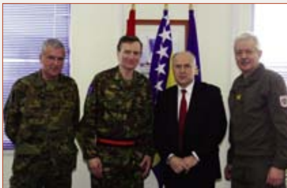
By Lt Cdr Andy Willis

ing the continued important presence of EUFOR in BiH, in light of the decision of the Foreign Affairs Council of the European Union on the 25th January 2010 to develop the EUFOR Althea mission, alongside the current role of maintaining the safe and secure environment, towards the provision of capacity-building and training support to the Armed Forces of Bosnia and Herzegovina.