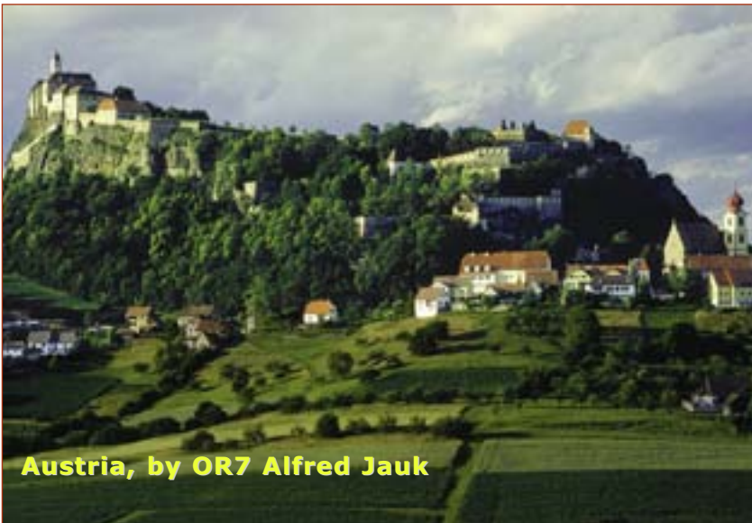
Austria