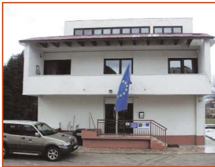
◆ LOT Bugojno