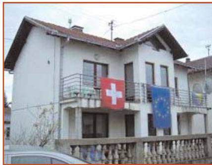
◆ LOT Bosanska Gradiska