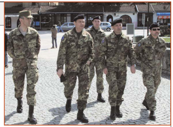
energy and work for Visegrad and finally the city centre, made charming by the beautiful sunny day. COM EUFOR was pleased to find such a integrated personnel team.

The power plant not far from the bridge, source of