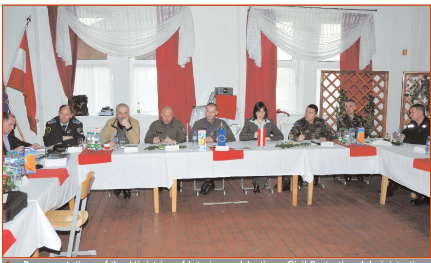
Representatives of the Ministries of Interior and Justices, Civil Protection Administration, Armed Forces of BIH (AFBIH) and the International Community exchanged information on uture procedure in destruction of harvested materials