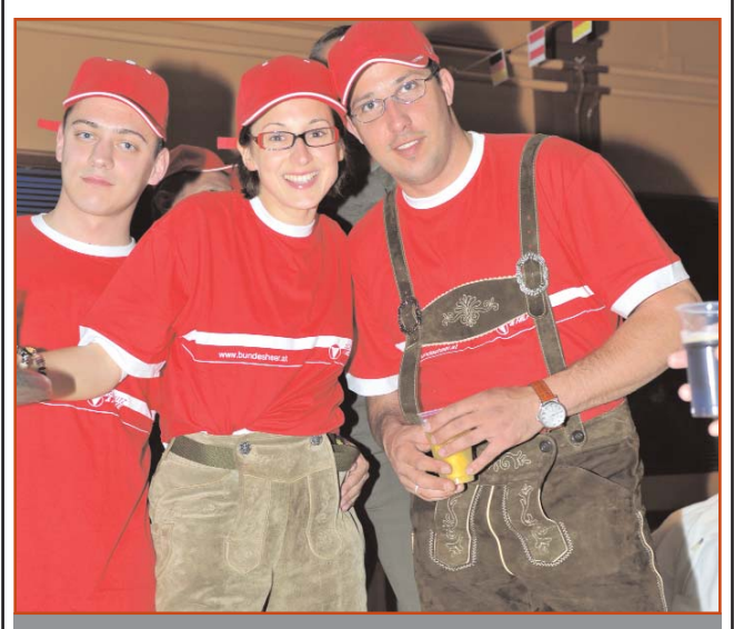
Bratwuerstel, steaks and salads were served and civilian as well as military guests out of the international community enjoyed the party. The band "Le Monde" from Croatia played excellent music and the guests enjoyed food, drinks and dance. Members of the RCC4 showed their traditional Austrian roots by wearing "Lederhosen"