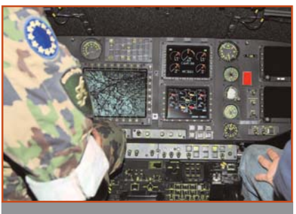
Inside of a cockpit