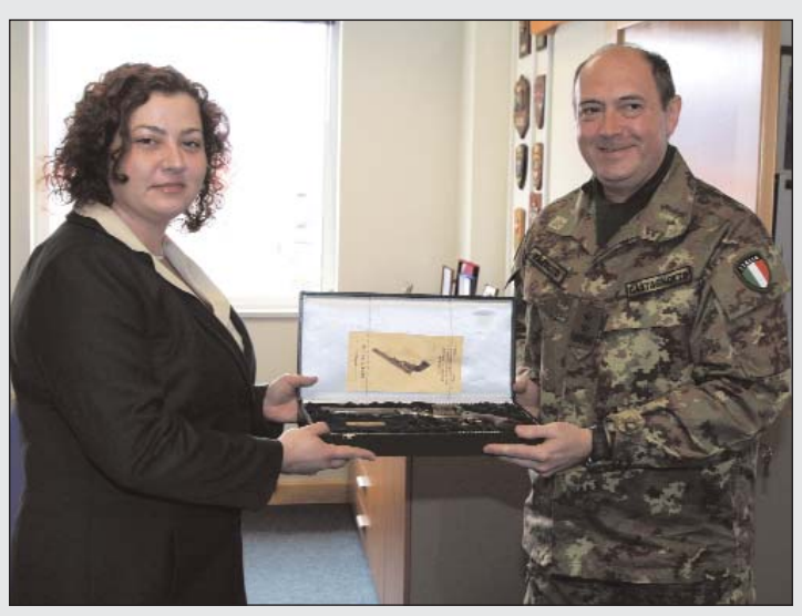
Senior State Secretary of MoD