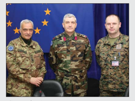
Some of MAPEX participants

The exercise scenario was based on preventing the illegal seizure of stored weapons and military equip-