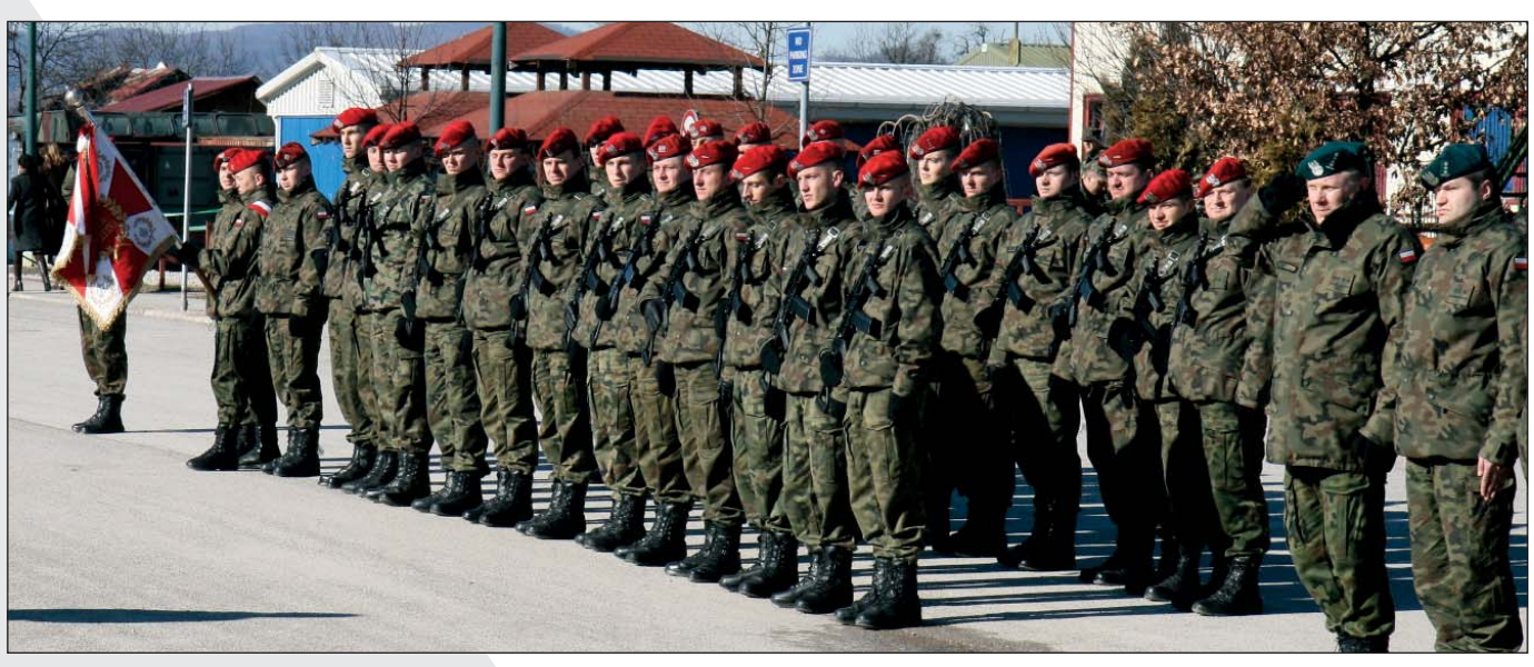
Change of Command in Polish Contingent