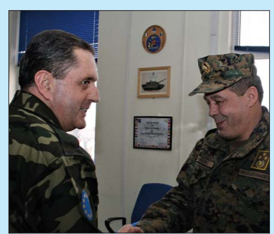
COM EUFOR and Lieutenant General Sifet Podzic

Specifically the recent success of the countermining activity was reviewed. Also raised was the issue of weapons and ammunition storage sites. EUFOR and the AFBiH have been conducting joint activities in the process of verification and significant progress has been made recently. The stor-