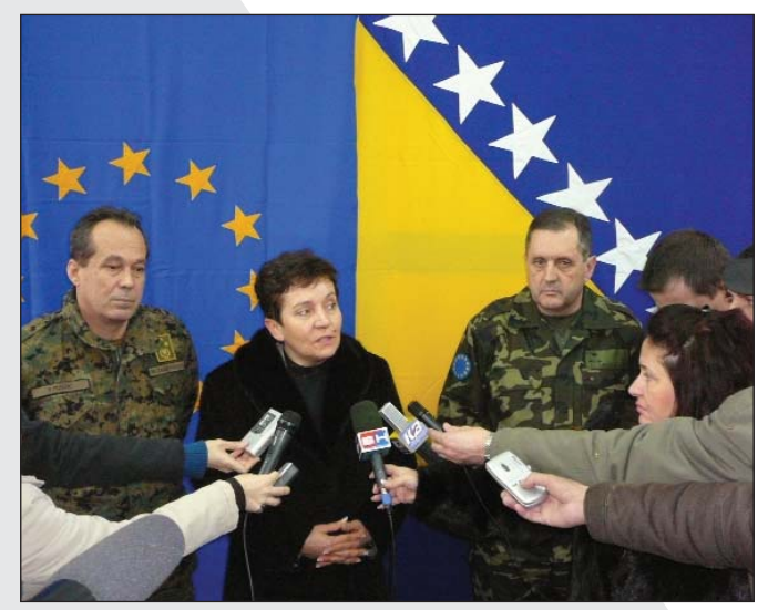
Statements to the media

The Armed Forces of Bosnia and Herzegovina continue to play an important role in the integration of country into Europe and NATO and these models show the success that can be achieved when the will exists. COM EUFOR personally congratulated those present "for the successful implementation of the BiH Defence Reform".