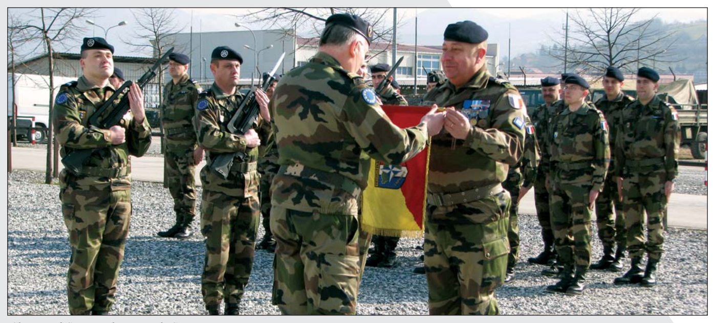
Change of Command in French Contingent