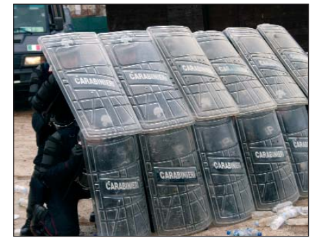
TESTUDO formation in action

tion of the crowd followed by their vehicles assuming the TESTUDO formation when objects were launched. Despite the move forward, the most violent hardliners remained for more confrontation and within a flash a maneuver team stepped out from the formation and