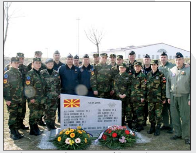
EUFOR Lays Macedonian Memorial Stone in Camp Butmir