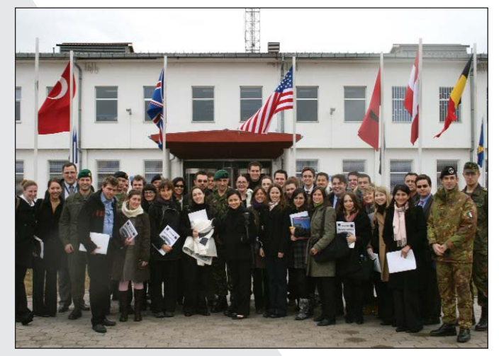
Students and the Press Office

The CCSDD provides research and training for individuals and groups from countries undergoing the process of democratic transition in Central and South Eastern Europe, as well as North Africa. Through conferences, workshops, and other programs, the CCSDD